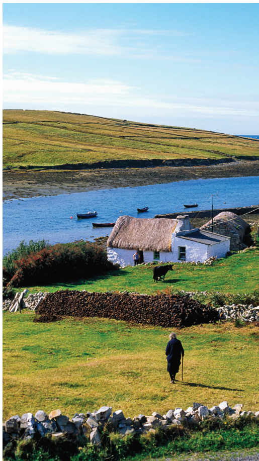
Stone walls wind through the Aran Islands.