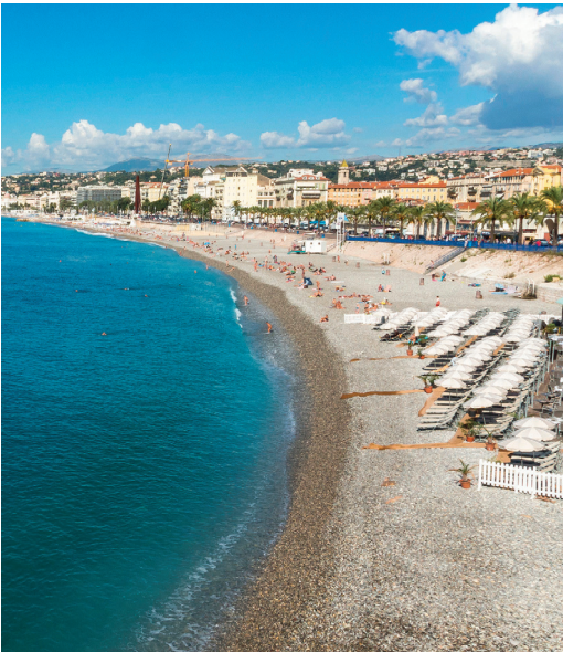
Nice’s iconic Promenade des Anglais