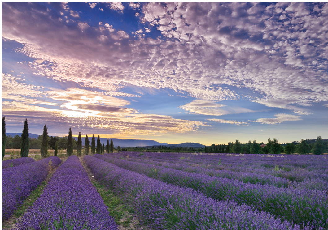
Fragrant fields of lavender mark Provence.

Day 6: Saintes-Maries-de-la-Mer Our exploration of the Camargue begins with a visit to a manade , a traditional ranch where gardians (cowboys) raise bulls both for meat and to perform in local arenas. We learn about the traditional way of life as we tour the manade , watch the gardians manage their herds while on horseback, and enjoy a lunch of local specialties. Then we head to the Pont de Gau ornithological reserve in the heart of the Camargue Regional Natural Park. We're likely to see the pink flamingos for which the park is known, as well as species of heron, birds of prey, and seasonal migratory birds. B,L