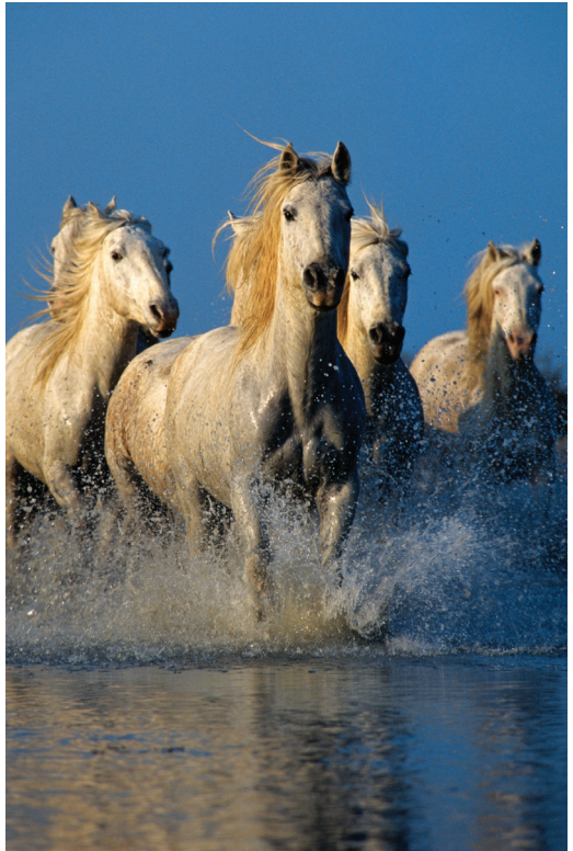
Unique white horses of the Camargue

Day 12: Depart for U.S. Today we depart for the Nice airport and our return flights to the U.S. B