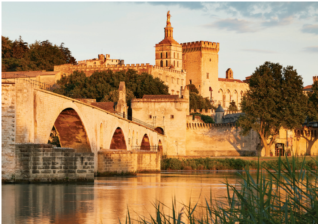
Avignon's famous bridge and the Palais des Papes

Day 6: Saintes-Maries-de-la-Mer Our exploration of the Camargue begins with a visit to a manade , a traditional ranch where gardians (cowboys) raise bulls both for meat and to perform in local arenas. We learn about the traditional way of life as we tour the manade , watch the gardians manage their herds while on horseback, and enjoy a lunch of local specialties. Then we head to the Pont de Gau ornithological reserve in the heart of the Camargue Regional Natural Park. We're likely to see the pink flamingos for which the park is known, as well as species of heron, birds of prey, and seasonal migratory birds. B,L