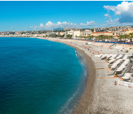
Nice’s iconic Promenade des Anglais