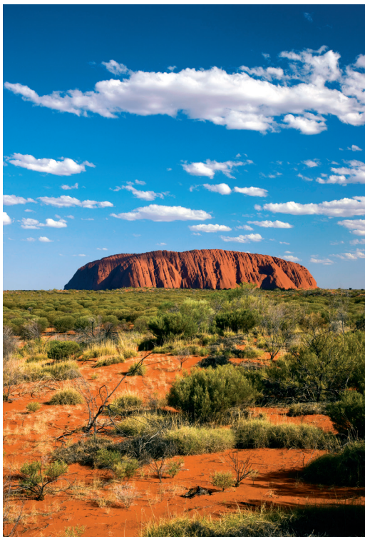
We visit the Aboriginal site of Uluru (Ayers Rock) on Day 8.