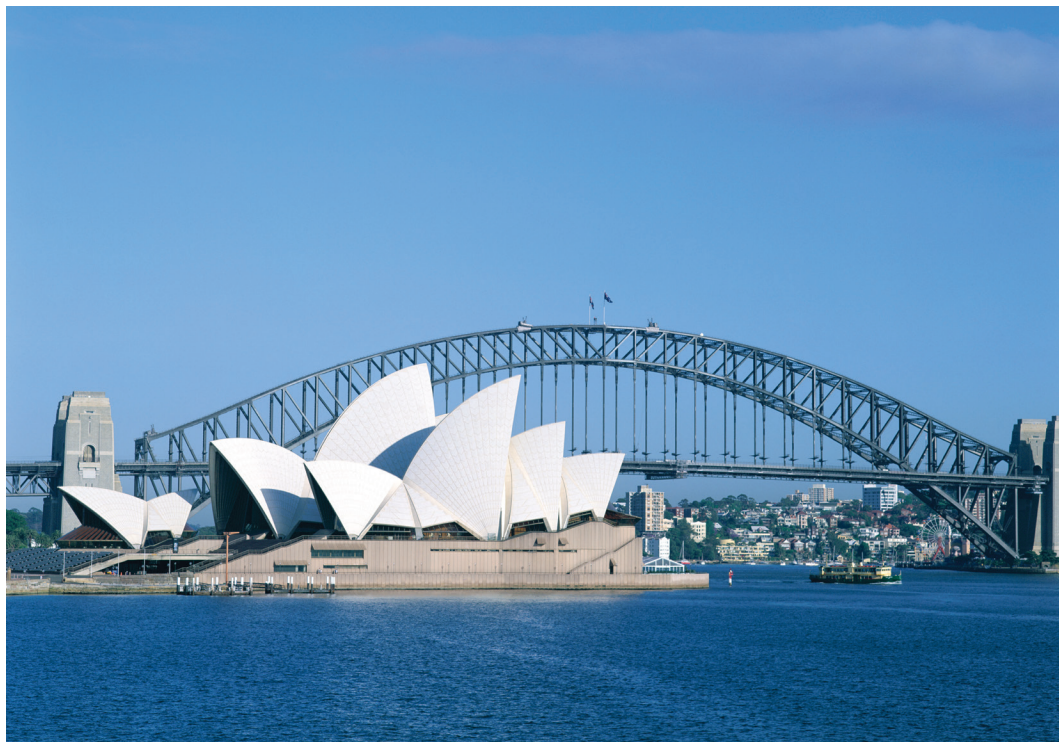
Sydney's iconic Opera House, which we tour on Day 12

Day 9: Ayers Rock/Sydney This morning we visit the base of Uluru and the interesting museum here. Mid-day we fly to Sydney, arriving late afternoon. B,D