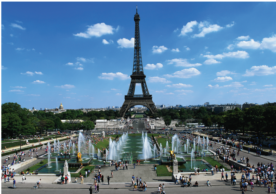
Discover Paris with its iconic Eiffel Tower.

some of Sarlat's museums or art galleries – or simply to wander the atmospheric cobblestone streets. After lunch on our own we visit nearby Rocamadour, a revered pilgrimage site and medieval village whose three tiers cling almost impossibly to a sheer limestone cliff. We take a guided walking tour then enjoy some free time before we return to Sarlat mid-afternoon and dine together tonight. B,D