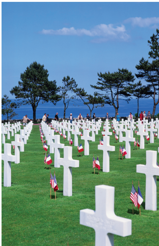
On Day 12, we visit the American Cemetery overlooking Omaha Beach.