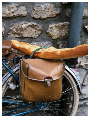
Rural French scene

where Allied forces overcame overwhelming odds to alter the course of World War II; 2019 marks the 75 th anniversary of the invasion of Normandy. We visit Pointe du Hoc, where American Rangers scaled towering cliffs to establish a beachhead; Utah Beach; and Ste-Mère-Église, where the 82 nd Airborne Division successfully parachuted on June 5, 1944. We end the day at the American Cemetery overlooking Omaha Beach in Colleville. It's a particularly moving site; row upon endless row of white marble crosses and Stars of David honor the nearly 10,000 American troops who lie here. B,L,D