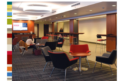
THE NEW STUDENT COMMONS. A GREAT PLACE FOR STUDENTS TO GATHER.