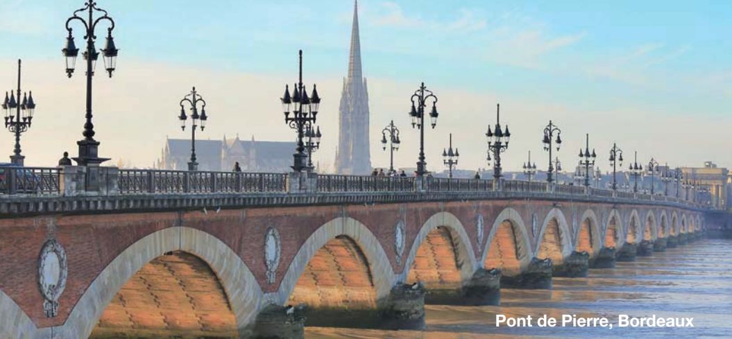
Pont de Pierre, Bordeaux