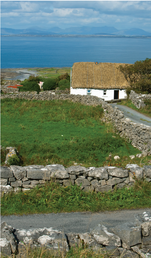
We spend Day 6 on the Aran Islands’ Inishmore.