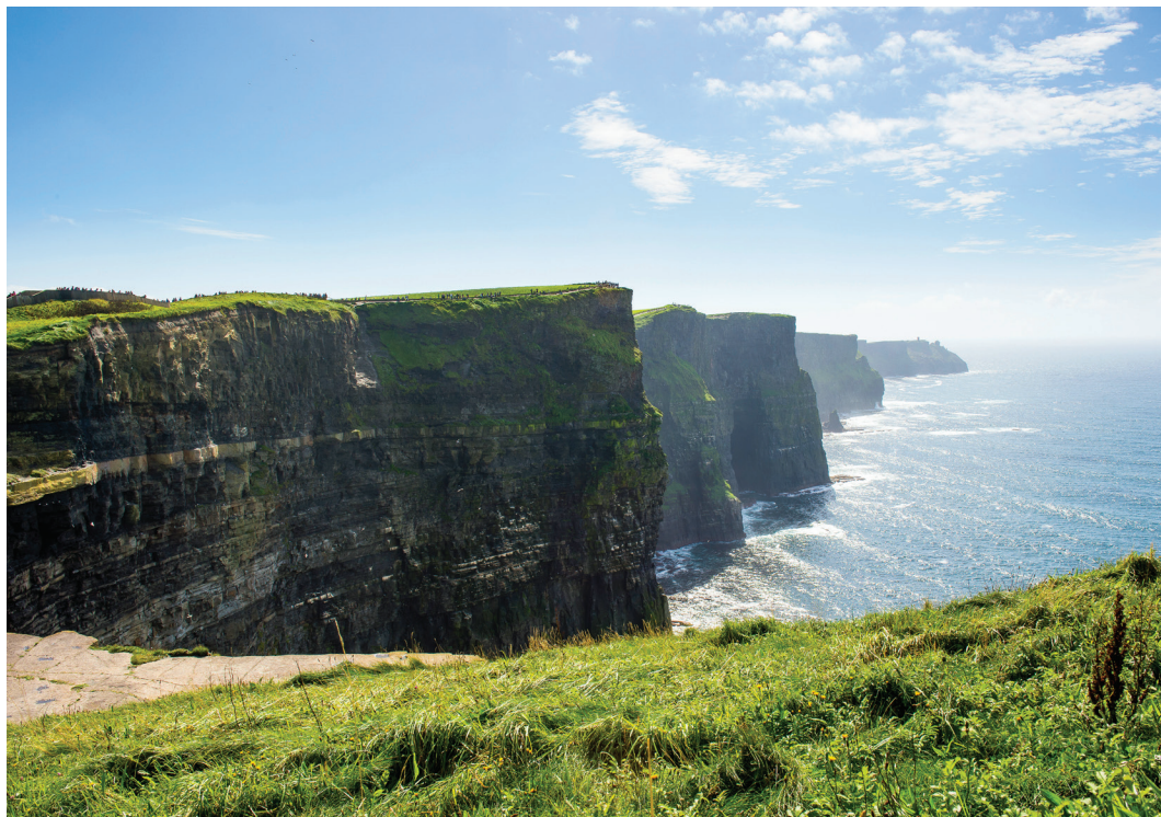
The sun shines down on the Cliffs of Moher, as we see on Day 7.

here, imparting local lore along the way. We stop at Dun Aenghus Fortress, the three prehistoric stone walls crowning the tallest cliffs of Inishmore; have lunch in a local pub; and enjoy some free time before returning to the mainland and our hotel late this afternoon. Dinner tonight is at a local restaurant in the village of Bearna. B,L,D