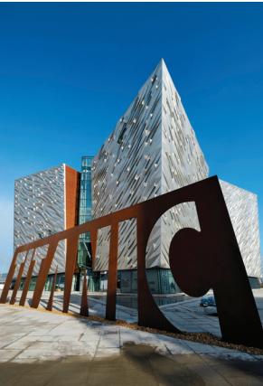
Titanic Museum, optional extension

Day 11: Kilkenny Today is devoted to Kilkenny, a well-preserved medieval city known as Ireland’s cultural capital – and the country’s smallest city. We tour 12 th -century Kilkenny Castle, considered one of the country’s most beautiful, then embark on an informal walking tour of Kilkenny itself, noting the many buildings of