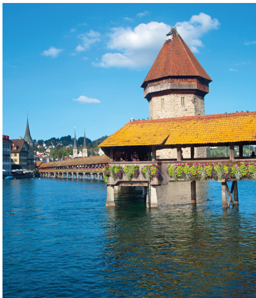
Lucerne’s beloved Kapellbrücke (Chapel Bridge)

operated continuously for more than 500 years. Then we return to Salzburg for an afternoon at leisure before tonight’s farewell dinner. B,D