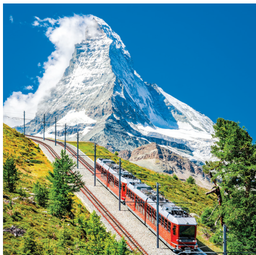
The Gornergratbahn railway

Day 13: Salzburg/Eagle’s Nest/Berchtesgaden We travel today to the Bavarian resort town of Berchtesgaden, site of the clifftop Kehlsteinhaus (Eagle’s Nest), the Nazi Party’s alpine retreat. In the event Eagle’s Nest is closed because of unseasonal weather, we’ll visit the nearby Berchtesgaden Salt Mine, which has