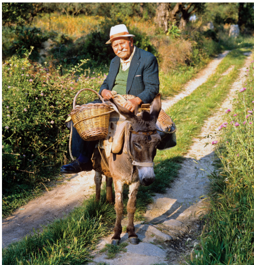
Old ways endure ...

Day 13: Santorini/Athens This morning we encounter Santorini from another perspective, as we embark on a private cruise around the island and its caldera, the flooded volcanic crater that forms Santorini’s half-moon