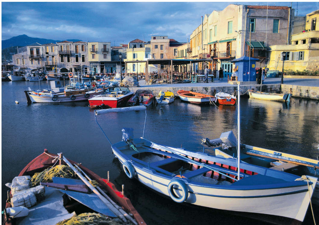
On Day 10, we cruise to Spinalonga.

Day 6: Mycenae/Epidaurus It's a day steeped in ancient history as we first tour the imposing ruins at Mycenae, a UNESCO site that represented the pinnacle of civilization from the 15 th to the 12 th centuries BCE. A key influence on the development of classic Greek culture (and hence Western civilization), Mycenae also is linked to Homer's epics, Iliad and The Odyssey . We see the Tomb of Agamemnon, with what was the world's highest and widest dome for more than a thousand years, and the Lion's Gate, the only known Bronze Age monumental sculpture in Greece. We move on the vast archaeological site and museum of Epidaurus, with its 2,300-year-old theater – a master-piece of Greek architecture known for its perfect acoustics – still in use today. Long associated with healing and medicine, Epidaurus comprises one of the most complete sanctuaries remaining from antiquity. Then we return to Nafplion, where the afternoon is free for lunch on our own and perhaps to explore this gem of a Venetian/Byzantine town with picturesque narrow streets, fortifications, and a bounty of waterfront cafés. Tonight, we enjoy dinner together at a local taverna . B,D