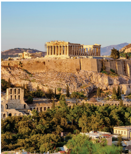
On Day 3 we visit the Acropolis in Athens.

shaped bay. Then we transfer to the airport for the flight to Athens, where tonight we celebrate our Greek odyssey at a farewell dinner. B,D