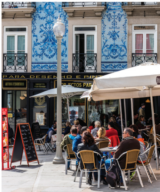
Café life in Portugal

a restored 19 th -century palace mid-afternoon, we have time at leisure until we gather to celebrate our discoveries at tonight’s farewell dinner. B,D