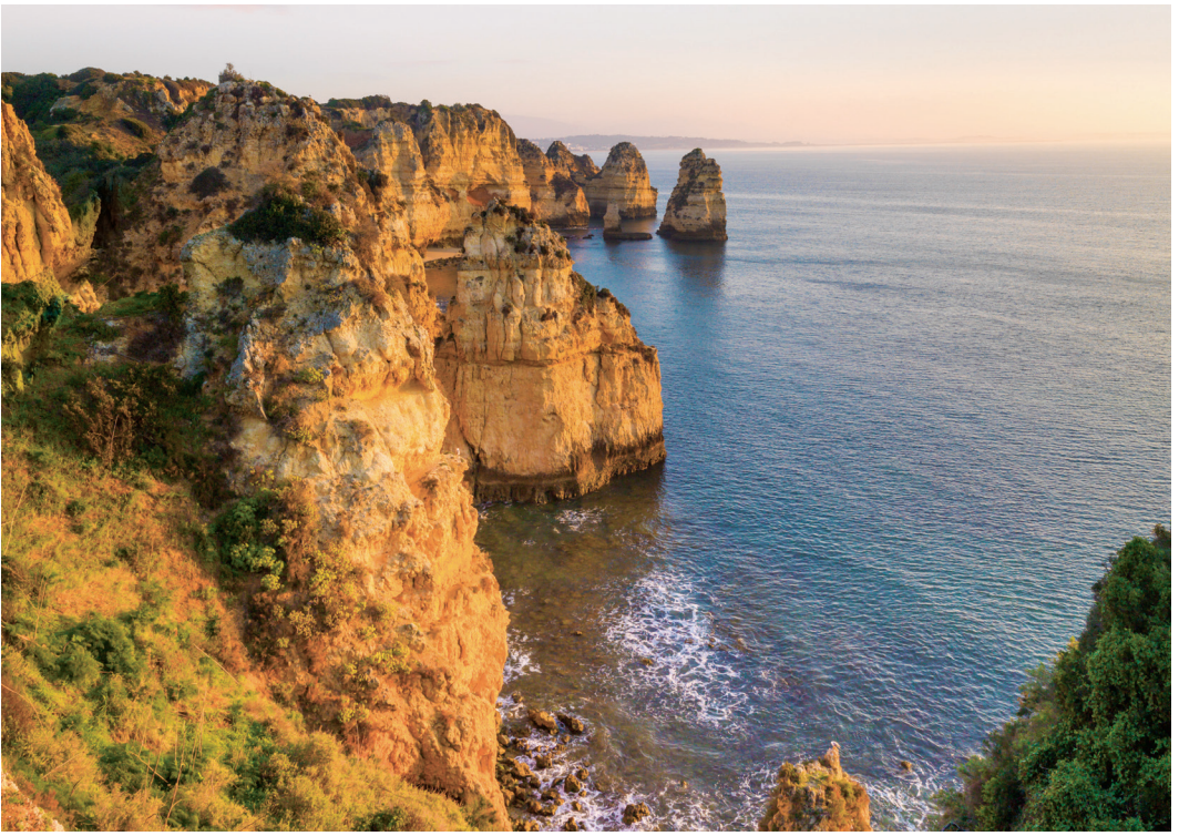
We see the Ponta da Piedade rock formations on Day 11.

bell tower. Then we enjoy a private “six-bridge” cruise on the Douro, upon whose banks the Romans planted grape vines millennia ago. Our tour ends with a visit to a port lodge for a tasting of the fortified wine exclusive to this region. The remainder of the day is free to enjoy this fascinating city as we wish, perhaps to wander the narrow cobbled streets of the medieval Ribeira (riverside) district – or to stroll the broad boulevard and public square of Praça da Liberdade, flanked by imposing civic buildings and trendy boutiques. We dine together tonight. B,D