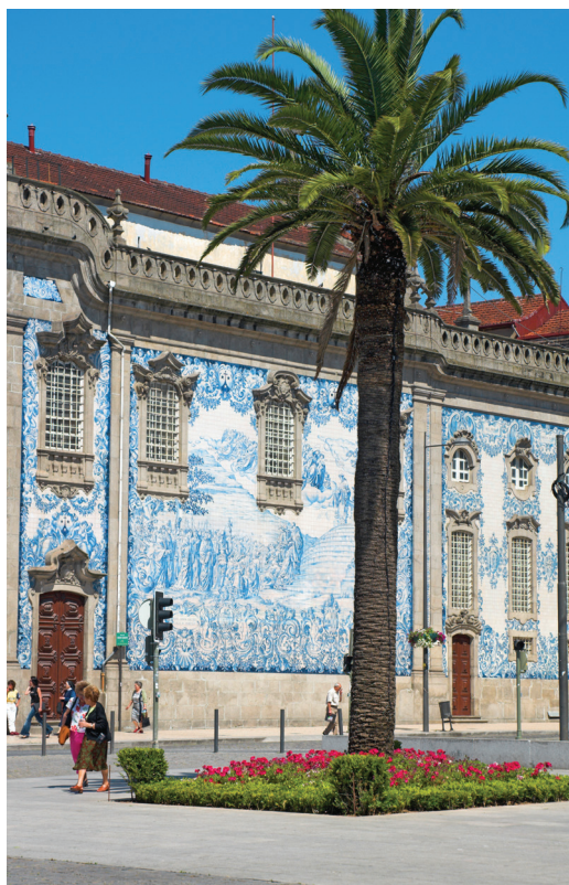
Signature Azulejo tiles in Porto

Day 12: Sagres/Lisbon We embark on a leisurely drive back to Lisbon today, stopping for lunch on our own along the way. After reaching our hotel in