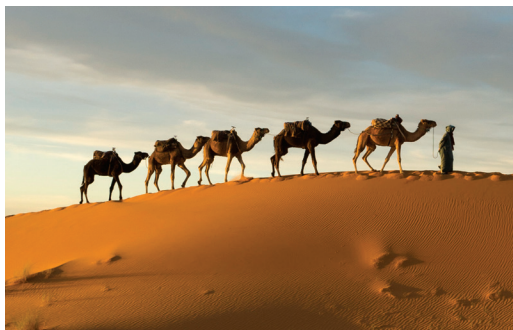
We ride camels in the Sahara on Day 8.

which is still used by the royal family); and the ruins of 16 th -century Palais El Badii. On the way back to the hotel, we stop to see the oldest historical gate of Marrakech, Bab Agnaou, built in the 12 th century. Dinner tonight is at a local restaurant in the city's Old Town. B,D