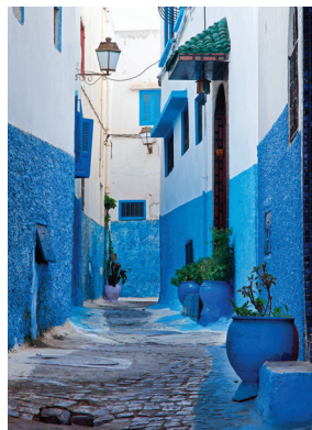
Rabat's Kasbah des Oudaias

Day 11: Marrakech Once the capital of southern Morocco, the imperial city of Marrakech is an alluring oasis with a temperate climate, distinct charm, and fascinating sights. This morning we travel by horse-drawn carriage from Menara Park to Majorelle Gardens, a private botanical garden with some 15 species of birds native to North Africa and known for its cobalt blue