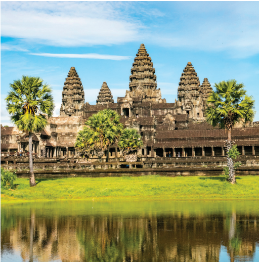
Angkor Wat (optional post-tour extension)

Day 13: Saigon A morning tour includes the former Presidential Palace, which served as the South Vietnamese government’s wartime headquarters. Now known as Reunification Palace, it was here that the first Communist tanks rolled into Saigon on April 30, 1975; it remains preserved as a museum almost exactly as it was on that day. We also tour the History Museum, with its excellent collection of art and artifacts of the