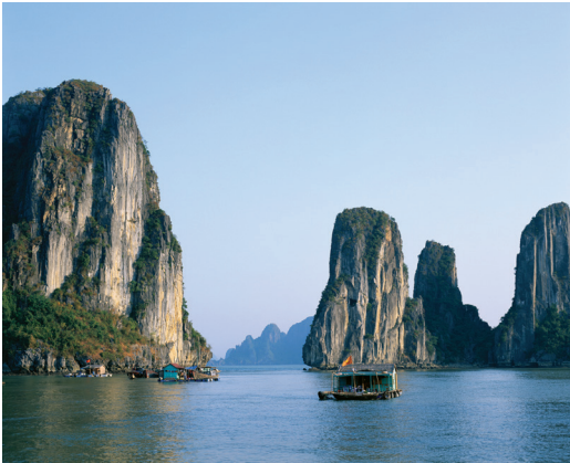
We visit Ha Long Bay on Day 4.

indigenous peoples of Vietnam. Later we attend a traditional water puppet performance. B,D