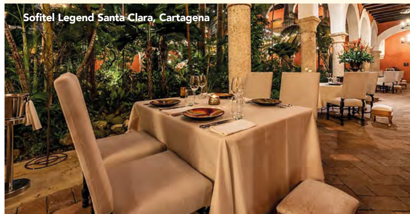
Sofitel Legend Santa Clara, Cartagena

Once a 17th-century convent, this meticulously restored hotel blends modern luxury with original colonial architecture, from arched walkways to stone courtyards. Stay in air-conditioned rooms featuring plush bedding and tranquil courtyard or city views. Relax at the spa, sip cocktails by the poolside bar, or enjoy the fitness center.