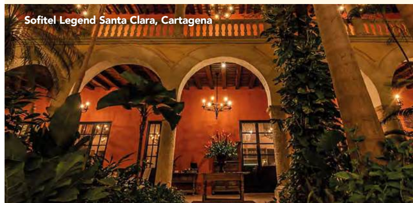
Sofitel Legend Santa Clara, Cartagena