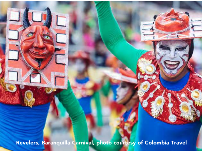
Revelers, Baranquilla Carnival

An optional postlude to Medellín is available from January 7–10, 2026. Details and pricing will be shared with confirmed guests at a later date.