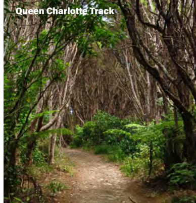
Queen Charlotte Track