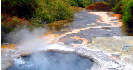
Geothermal pools in Rotorua.

Today at sea, relax and take advantage of the ship's many amenities as the educational program continues. HERITAGE ADVENTURER (B,L,D)