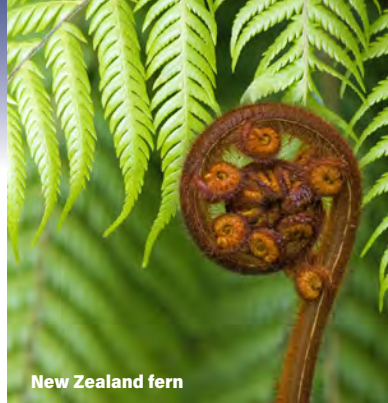
New Zealand fern