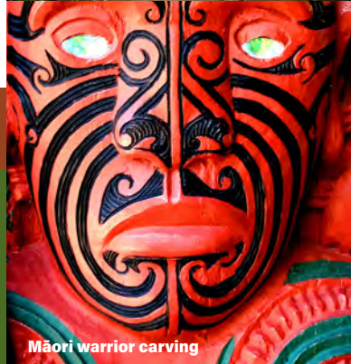
Māori warrior carving