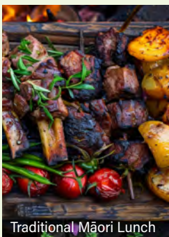
Traditional Māori Lunch