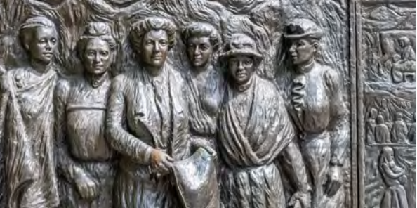
Kate Sheppard Memorial in Christchurch.

nature, culture, and history of Southern New Zealand. HERITAGE ADVENTURER (B,L,D)