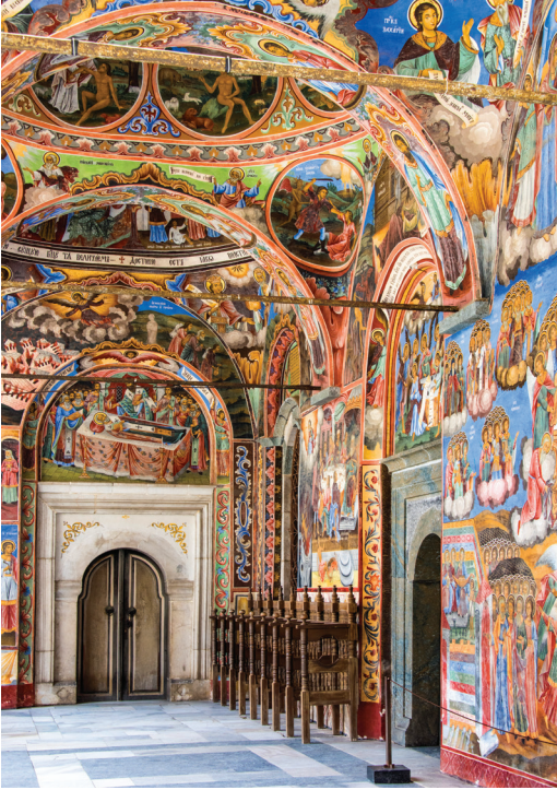
Sighisoara's medieval Old Town

Day 17: Depart for U.S. We transfer to the Bucharest airport for our return flights to the U.S. B