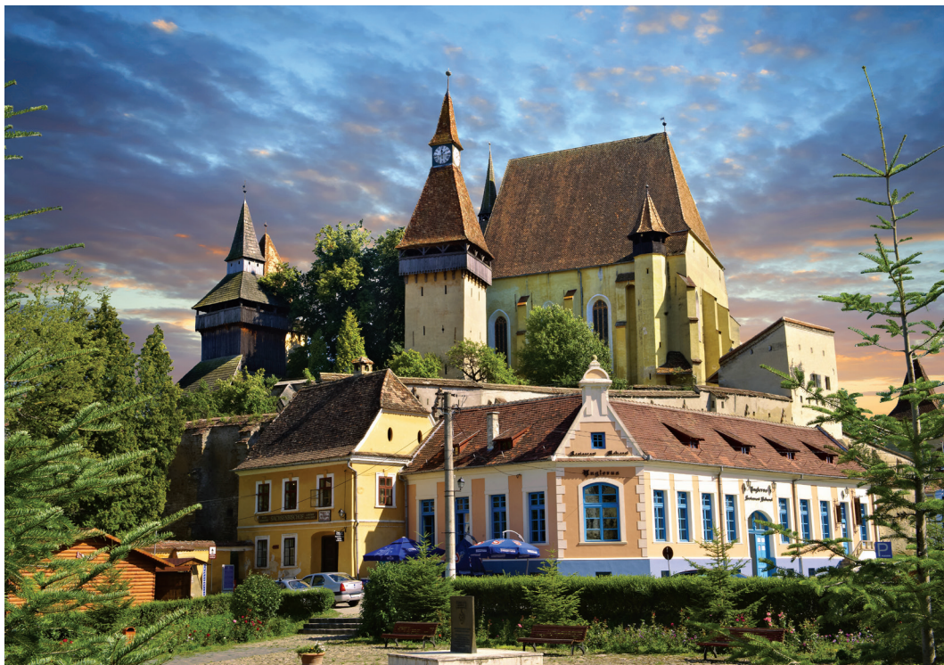
On Day 13, we visit Biertan's elaborate hilltop forfeited church.

Day 7: Plovdiv/Nessebar/Varna (Black Sea) Today we travel to the Black Sea resort of Varna, stopping en route in Nessebar, “Pearl of the Black Sea” whose ancient city is a UNESCO site. While the site retains traces of its occupation by a variety of civilizations over the millennia, most of the ruins that we explore today date from the Hellenistic period. After time for lunch on our own here, we continue on to Varna and our hotel. We dine together tonight. B,D