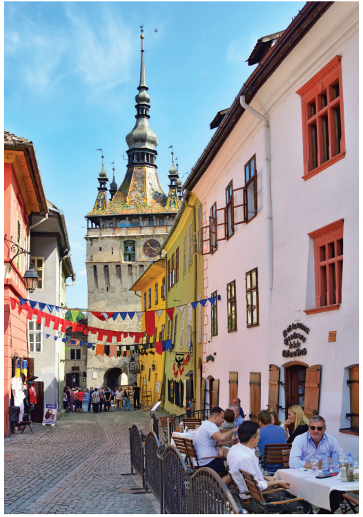
Sighisoara's medieval Old Town

Day 16: Brasov/Sinaia/Snagov/Bucharest Returning to Bucharest today, we stop in the mountain resort of Sinaia, "Pearl of the Carpathians," where we visit exquisite Peles Castle, former summer home of Romanian royalty. Then we head to Snagov Monastery, perched on a tiny island on a lake near Bucharest and, legend has it, burial site of infamous Vlad the Impaler,