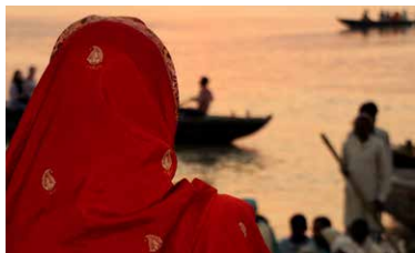
THE RIVER GANGA

Taj Ganges; ITC Mughal; Taj Mahal Hotel (4B, 4L, 3D)