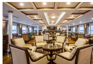
SUNDECK INDOOR LOUNGE