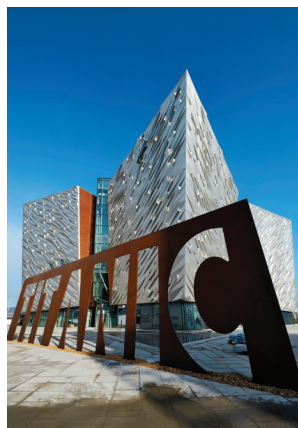
Titanic Museum, optional extension

tour of Kilkenny itself, noting the many buildings of “black” or Kilkenny marble, quarried locally. After lunch together at a local pub, the remainder of the day is at leisure. B,L