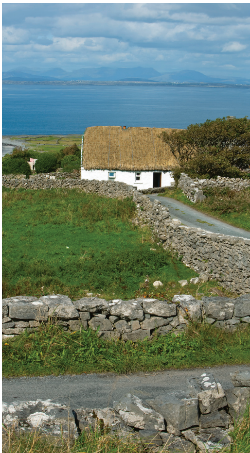
We spend Day 6 on the Aran Islands’ Inishmore.