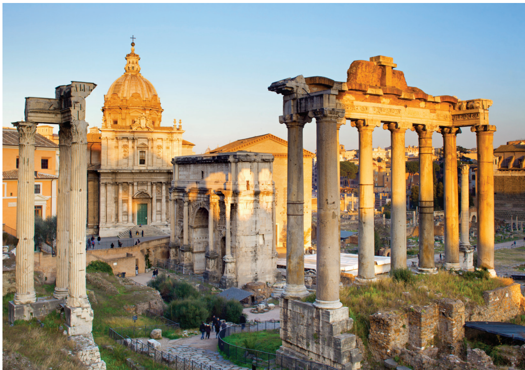
The Roman Forum dates to the 7 th century BCE.

Day 7: Rome Another morning of touring followed by a free afternoon. Today we visit the Vatican for a tour of St. Peter's Square and Basilica, and the Sistine Chapel in the Vatican Museums. Highlights include Michelangelo's Pieta in St. Peter's, considered one of the greatest sculptures of all time; his frescoed ceiling of the Sistine Chapel, now restored to its original glory; and art-filled St. Peter's itself, the most important church in all Christendom. B