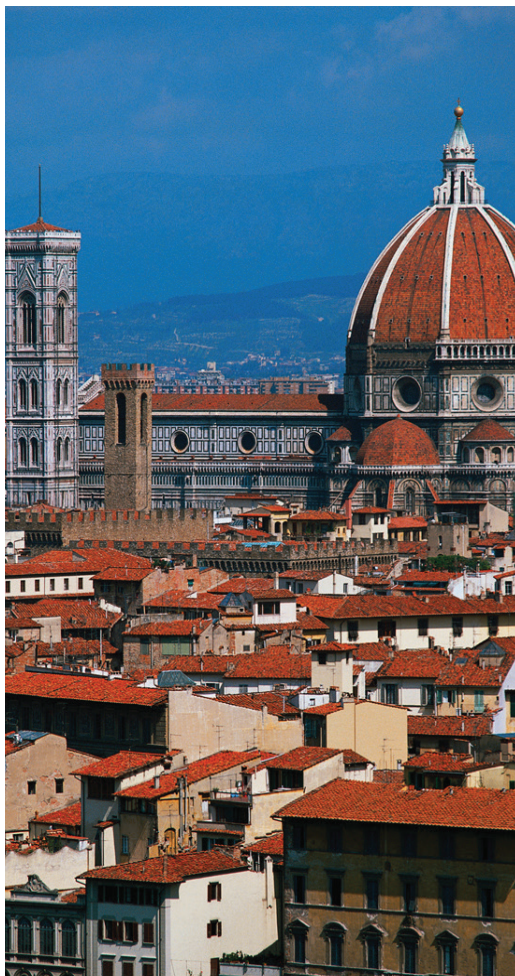
We visit splendid Florence on Day 12.