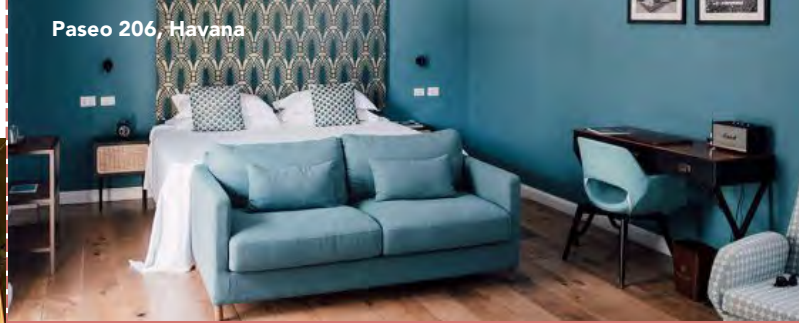
Paseo 206, Havana

NOT INCLUDED IN RATES International airfare; Cuban visa; Cuban Departure tax; limited Cuban health insurance policy (required for all foreign travelers to Cuba under age 80); passport fees; alcoholic beverages other than what is noted in inclusions; personal items and expenses; travel insurance; trip insurance; any other items not specifically mentioned as included.