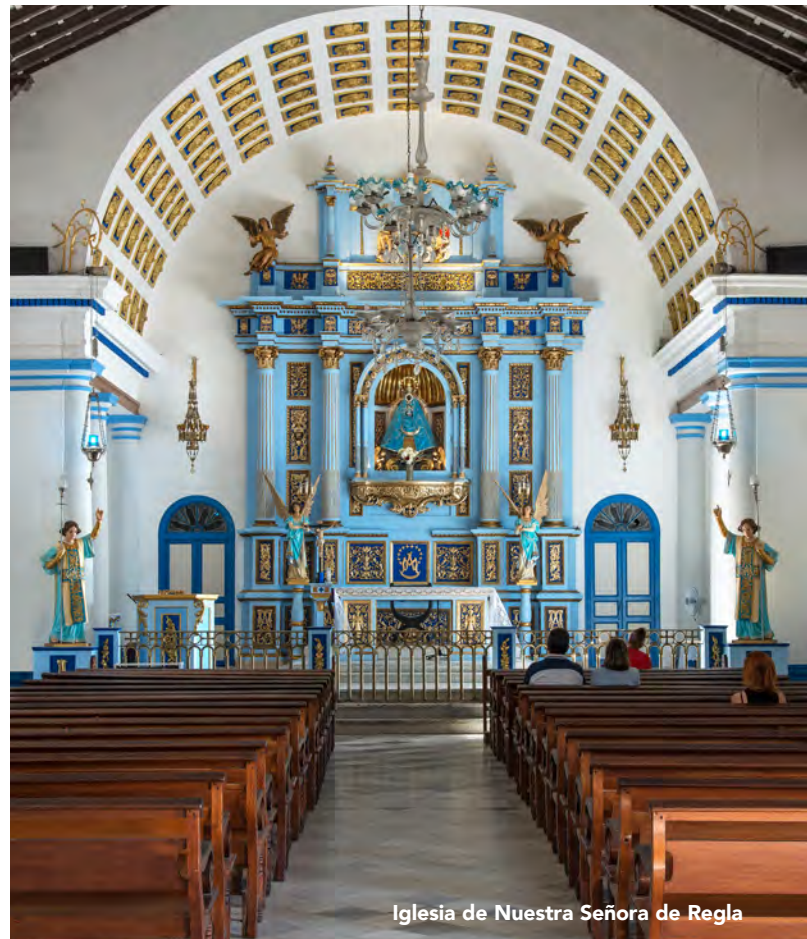
Iglesia de Nuestra Señora de Regla

Visit the nearby municipality of Regla , known for its deep-rooted traditions in Santería, Palo Monte, and other Afro-Cuban religions. Take a private look at the iconic Iglesia de Nuestra Señora de Regla , a church with a storied history in the Santería tradition.