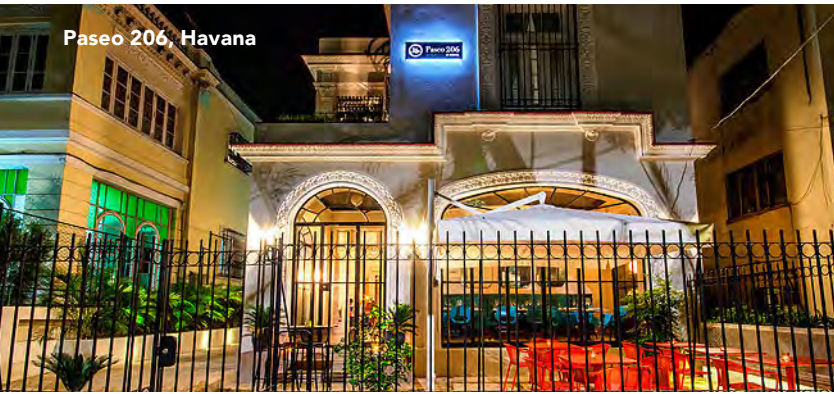
Paseo 206, Havana