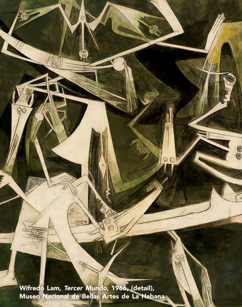
Wifredo Lam, Tercer Mundo , 1966, (detail), Museo Nacional de Bellas Artes de La Habana