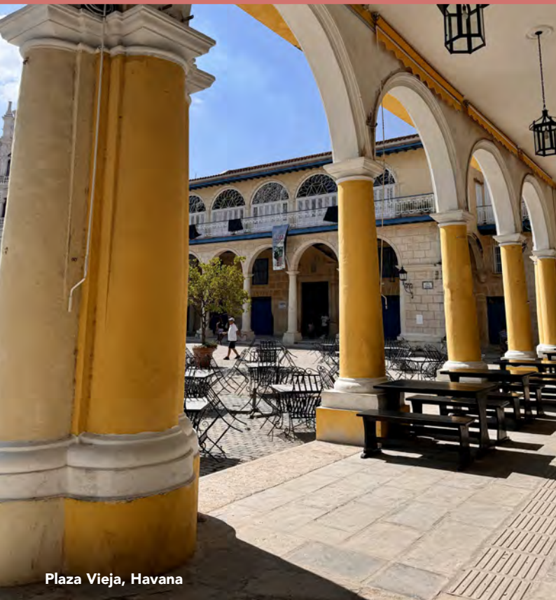
Plaza Vieja, Havana