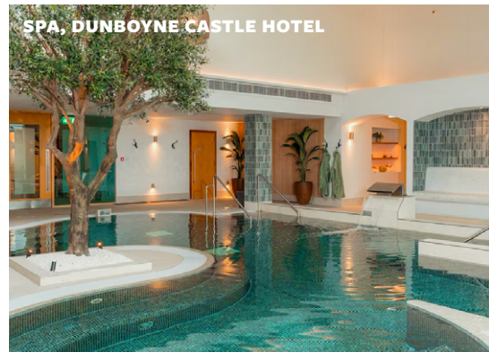
SPA, DUNBOYNE CASTLE HOTEL