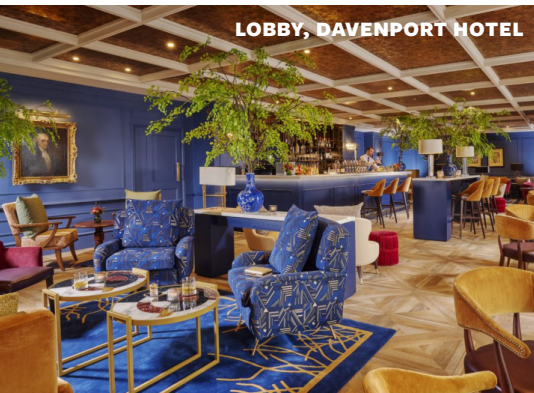
LOBBY, DAVENPORT HOTEL