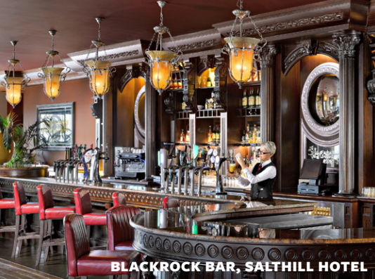
BLACKROCK BAR, SALTHILL HOTEL