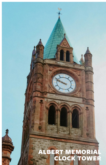
ALBERT MEMORIAL CLOCK TOWER