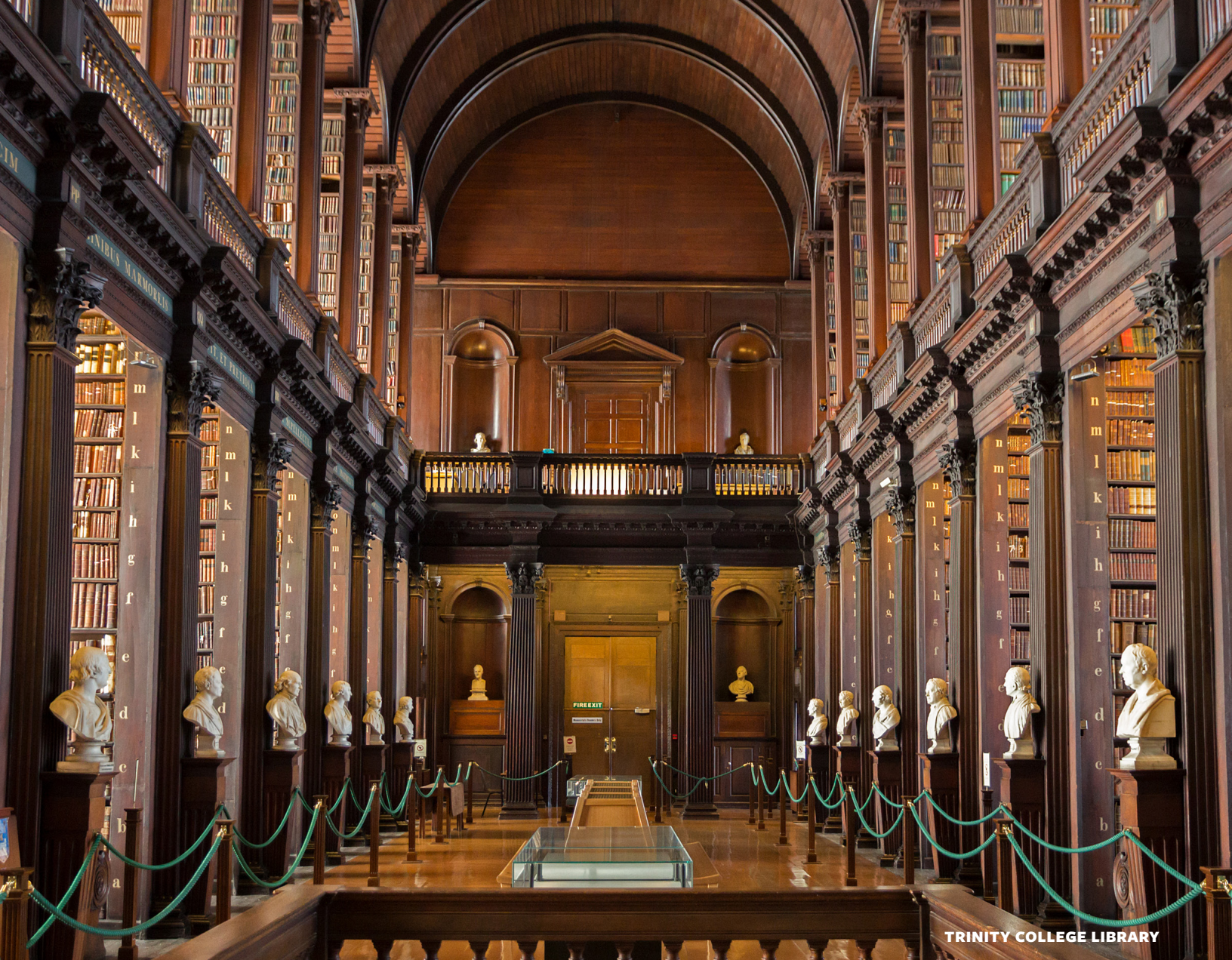
TRINITY COLLEGE LIBRARY