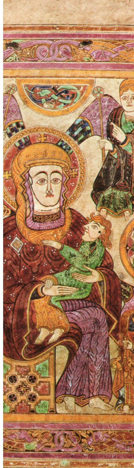
BOOK OF KELLS