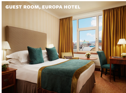
GUEST ROOM, EUROPA HOTEL