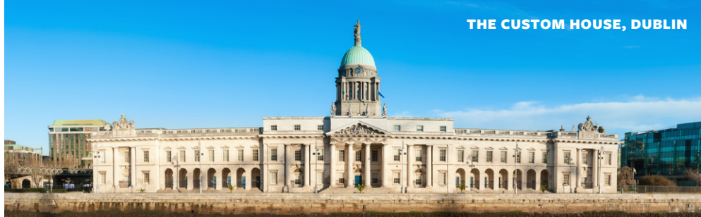
THE CUSTOM HOUSE, DUBLIN