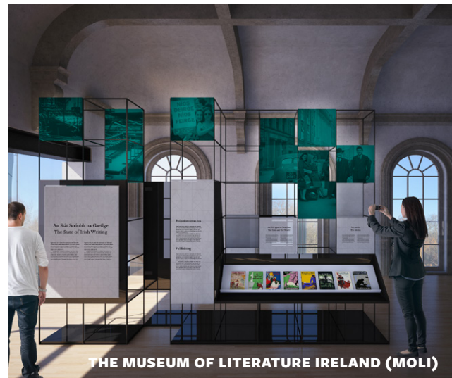
THE MUSEUM OF LITERATURE IRELAND (MOLI)

County Down followed by lunch at Tracey's Farmhouse. Upon arrival in Belfast, we'll embark on a city tour, which includes a visit to CS Lewis Square, which features seven bronze sculptures from The Lion, The Witch and The Wardrobe. View landmarks such as the leaning Albert Memorial Clock Tower and the historic Opera House. Lastly, we'll explore the history of Belfast's Troubles along the Shankill and Falls roads. THE EUROPA HOTEL (B, L)