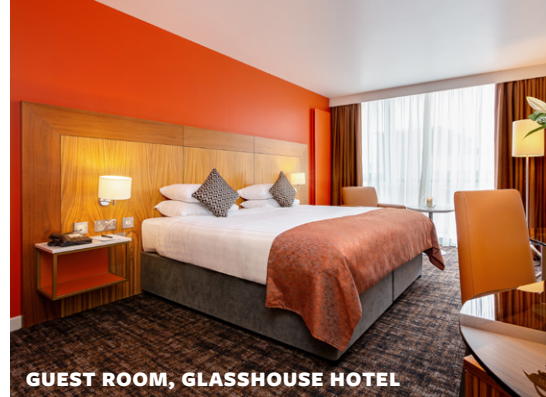
GUEST ROOM, GLASSHOUSE HOTEL