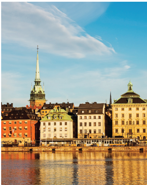
The sun sets over Stockholm, Sweden, as seen on optional extension.

contains at least one print of every painting that Munch created throughout his life, and more than half of his original creations. Then this afternoon is free to explore on our own; tonight we gather for a farewell dinner at our hotel. B,D