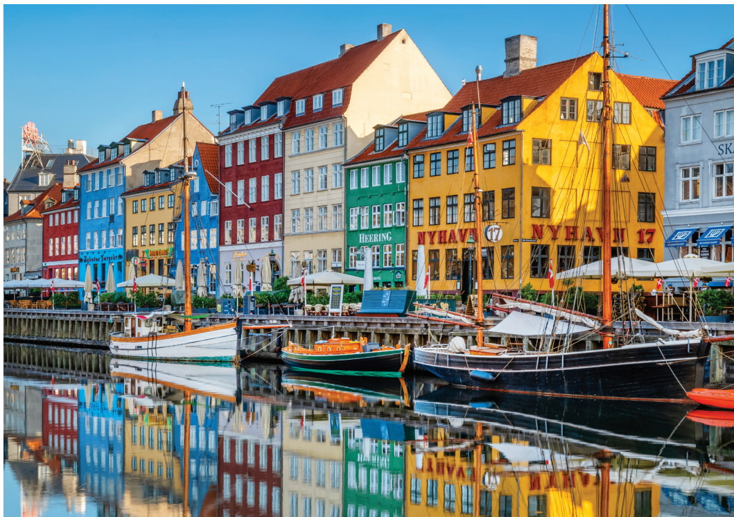
Copenhagen's lively Nyhavn waterfront area

Day 7: Hundorp/Geiranger A day of beautiful scenery is in store as we travel from Hundorp to Geiranger, en route negotiating hairpin bends to the summit of Mount Dalsnibba (alt. 4,900 feet) for stunning views of Geirangerfjord and the mountains, lakes, and waterfalls beyond. We reach the popular village of Geiranger mid-afternoon and get our first up-close look at Norway's most dramatic fjord. A UNESCO site, it measures 10 miles long and 960 feet deep. B,D