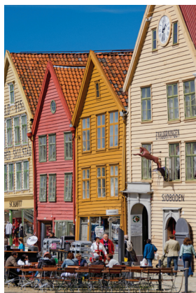
Bergen’s historic Bryggen district

Day 14: Oslo This morning we visit the Historical Museum, Norway’s largest collection of historical artifacts and ethnographic collections from the Stone Age and Viking era to modern times. We also tour