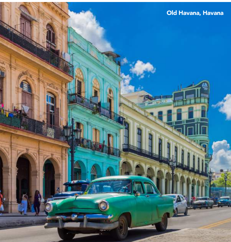
Old Havana, Havana