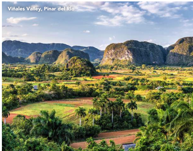
Viñales Valley, Pinar del Río

An independent curator will guide you on a private morning tour of the Museo Nacional de Bellas Artes de La Habana (National Museum of Fine Arts of Havana), Cuba's largest museum. Encounter the complex, colorful works of the country's leading modern and contemporary