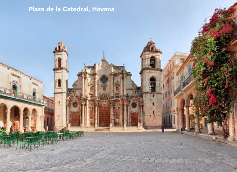
Plaza de la Catedral, Havana