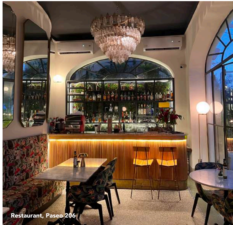
Restaurant, Paseo 206