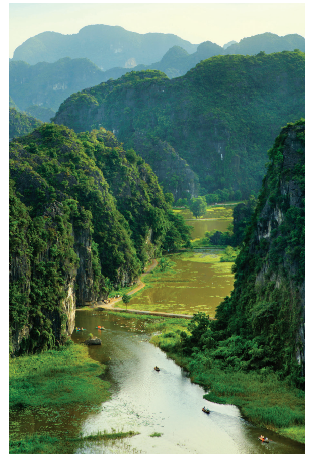
We spend two days amid the stunning landscape of Ninh Binh.