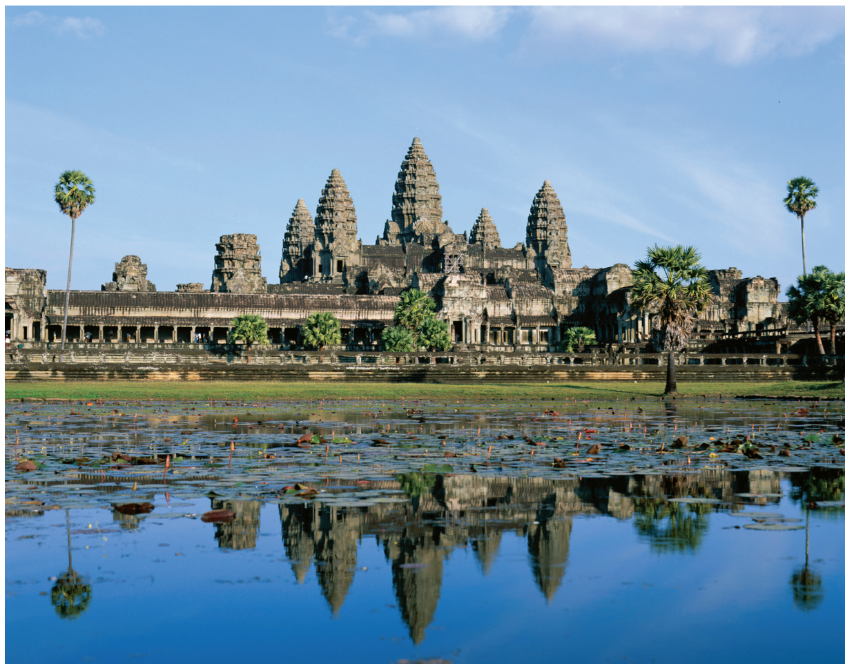
We spend three days touring Cambodia's Angkor Wat temple complex, one of Southeast Asia's most important archaeological sites.