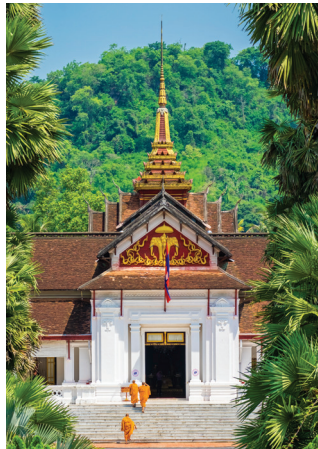
National Museum, Luang Prabang

Day 12: Siem Reap/Luang Prabang, Laos After a morning at leisure, we visit Satcha Handicrafts, a development project for young adults to learn traditional Cambodian crafts. From here we head to the airport for our late afternoon flight to Luang Prabang. B,D