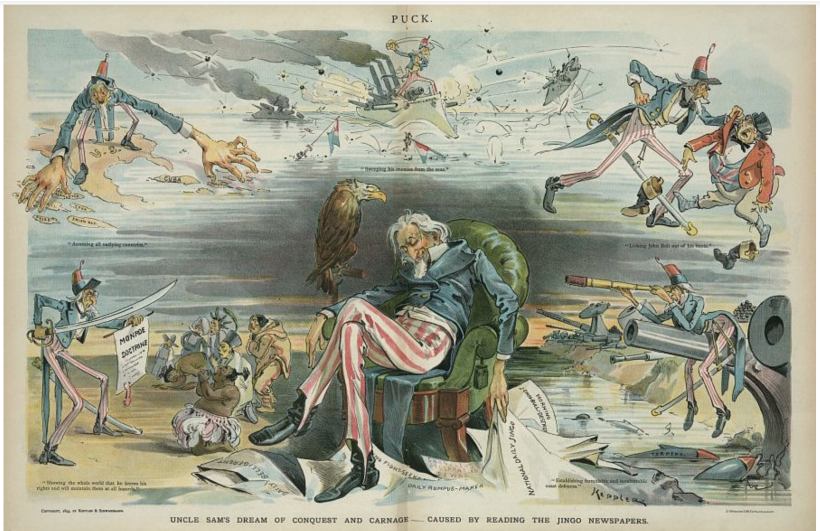
Uncle Sam's Dream of Conquest and Carnage – Caused by Reading the Jingo Newspapers (1895) — Source .

Source: Puck, v. 38, no. 975, (1895 November 13), centerfold.