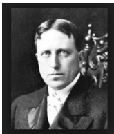
William Randolph Hearst, Owner of the New York Journal (1885)