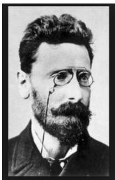
Joseph Pulitzer, Owner of the New York World (1884)