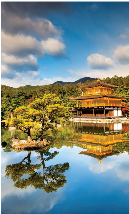
We visit Kyoto’s Temple of the Golden Pavilion on Day 10.