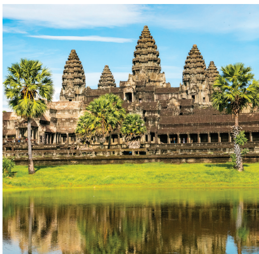
Angkor Wat (optional post-tour extension)

Day 15: Depart for U.S. Today we transfer to the airport for our return flights to the U.S. B