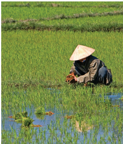
A local farmer tends a rice paddy.

Day 14: Saigon This morning we visit the Cu Chi Tunnels, the infamous underground network from