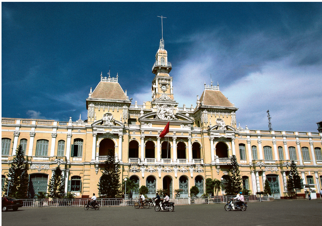
Observe the French architectural influences during a tour of Saigon on Day 13.

resort for a relaxing interlude. Tonight, we enjoy a cooking lesson and dinner in Hoi An. B,D