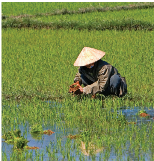
A local farmer tends a rice paddy.

which North Vietnamese forces operated in wartime. Tonight we celebrate our journey over a farewell dinner. B,D