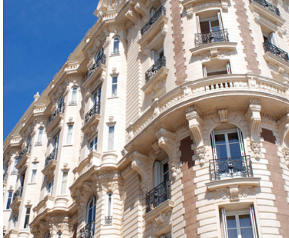
Cannes building architecture