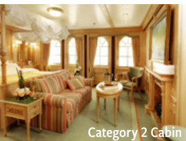
Category 2 Cabin