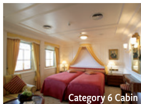
Category 6 Cabin