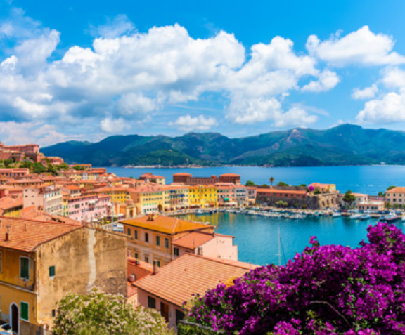
Isle of Elba