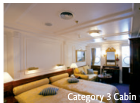
Category 3 Cabin