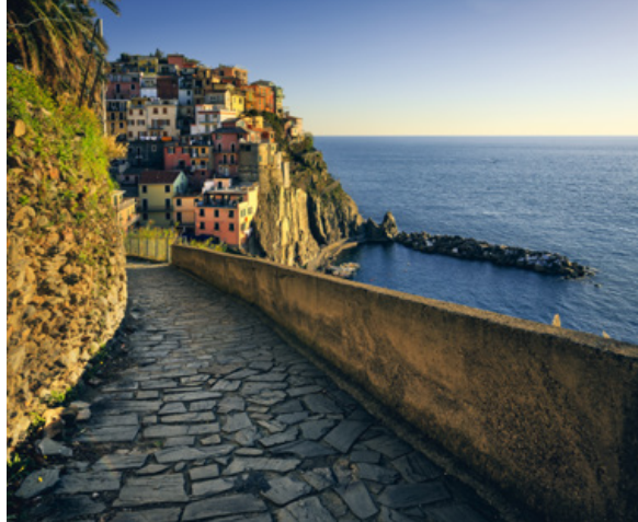
Manarola, Cinque Terre

birthplace of composer Giacomo Puccini and treasure chest of Tuscany's ancient trade in silk, with a stroll around the elliptical central piazza made up of medieval buildings outlining the ruins of a Roman amphitheater, as well as time to stroll around sections of the ancient city walls, now a park-like promenade. Return to the Sea Cloud II in the evening for dinner on board.