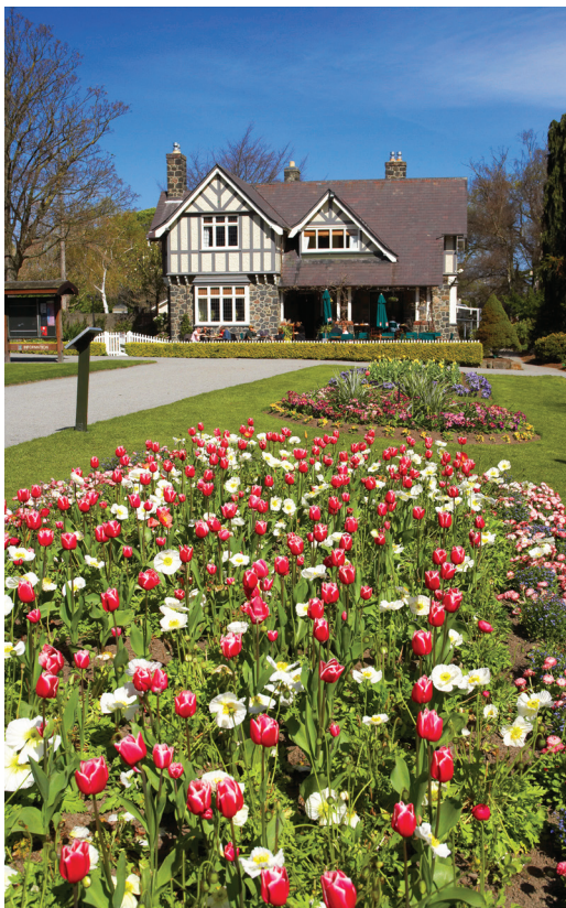
We tour Christchurch's Botanic Gardens on Day 10.