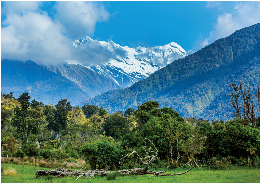
We spend two nights near splendid Westland Tai Poutini National Park.

Reaching Napier after lunch, we embark on a guided walking tour of the city's 1930s Art Deco architecture. After an earthquake leveled the city in 1931, it was rebuilt in "Deco" style; today, Napier ranks as one of the most authentically Art Deco cities in the world. Dinner tonight is on our own. B,L