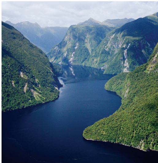
We cruise Doubtful Sound on Day 14.

Day 16: Depart for U.S. We depart this morning for the airport and our return flights home. B