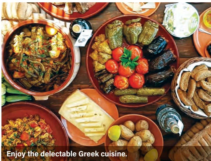
Enjoy the delectable Greek cuisine.

Transfer to the Heraklion airport for the return flight home. (B)