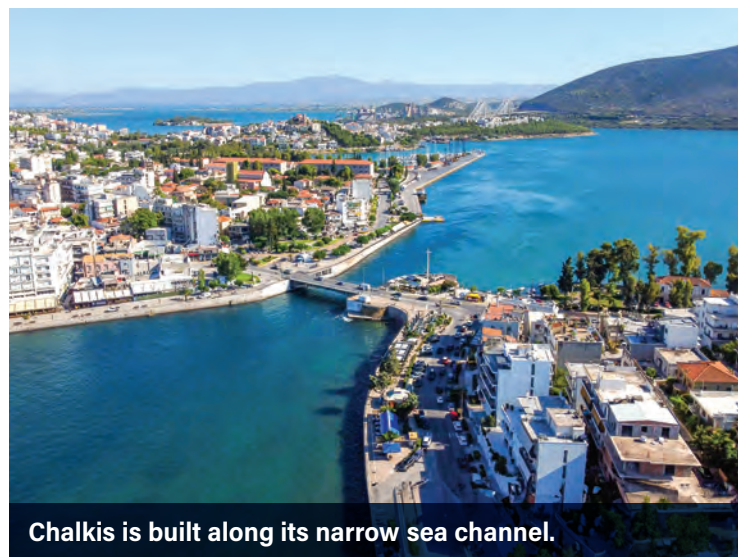
Chalkis is built along its narrow sea channel.