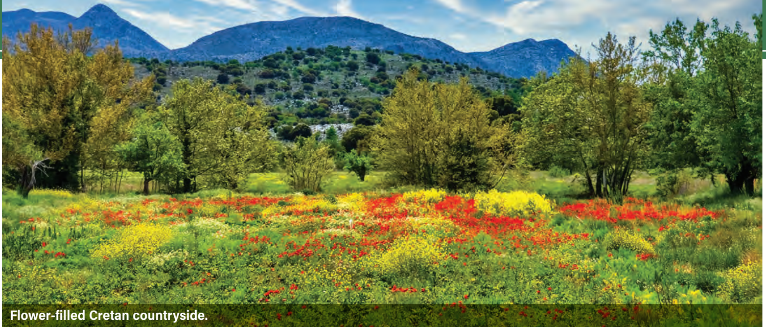
Flower-filled Cretan countryside.

Thermopylae, the site of the famous battle between the Persians and Greeks in 490 BC. Continue to the seaside town of Chalkis for lunch. Late afternoon flight to Heraklion, Crete. Upon arrival, transfer to the boutique Hotel Rimondi , an ex-palace that dates from the period when Crete was under the rule of Venice (13th – 17th centuries), located in the atmospheric town of Rethymno. (B, L, D)