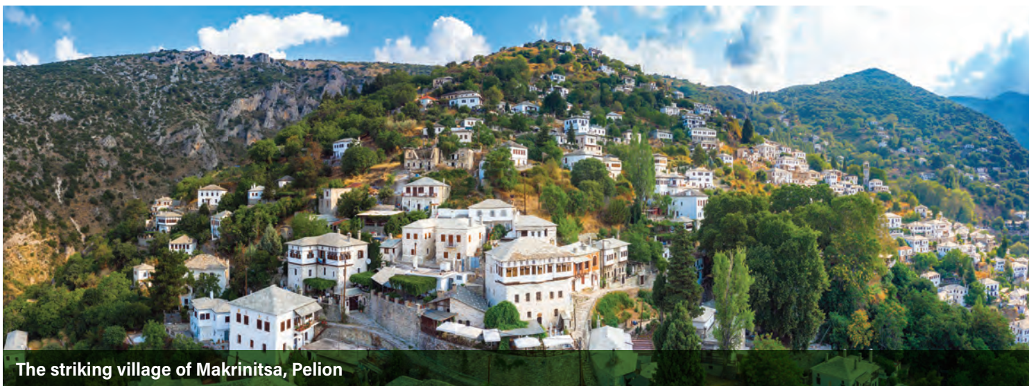
The striking village of Makrinitisa, Pelion