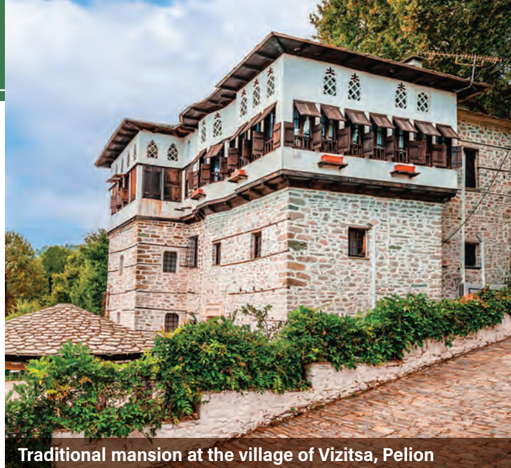
Traditional mansion at the village of Vizitsa, Pelion

Treasury of the Athenians; the Temple of Apollo; the Theater; and the Stadium. Visit also the Museum, which, among other treasures, houses the famous bronze statue of the Charioteer. After lunch, drive to Pelion. Accommodations in Pelion will be at the Hotel Xenia , in the quaint hillside village of Portaria, set 2,100 feet above sea level. (B, L, D)