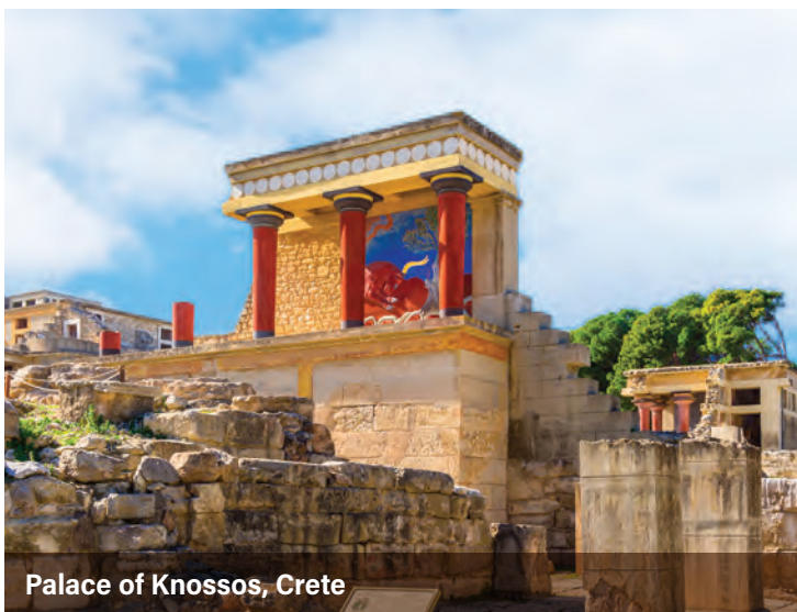
Palace of Knossos, Crete

Leave Athens in the morning for Delphi, the sanctuary of Apollo. One of the most impressive ancient sites in Greece, Delphi stands on high ground and is surrounded by towering mountains split by a ravine. Here, a priestess would render the oracles to those anxious to know the future. Explore the site, including the Sacred Way; the