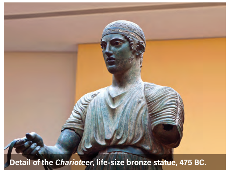
Detail of the Charioteer , life-size bronze statue, 475 BC.