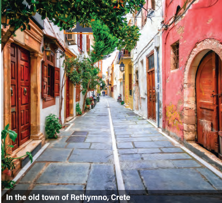
In the old town of Rethymno, Crete