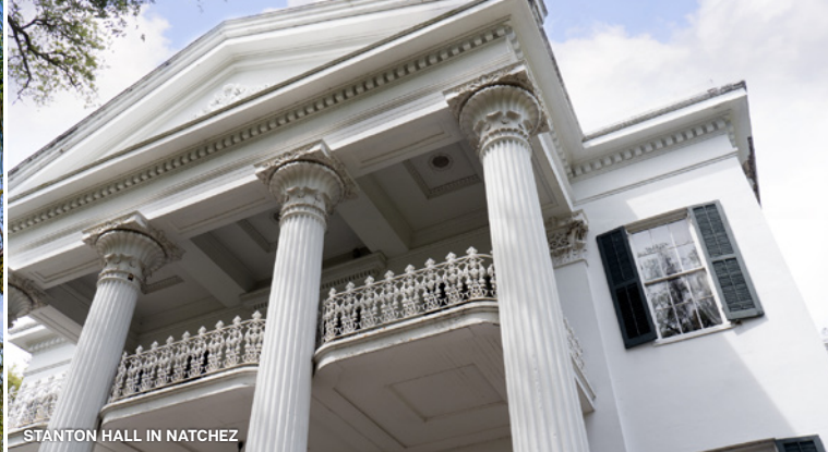
STANTON HALL IN NATCHEZ