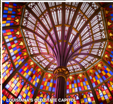
LOUISIANA'S OLD STATE CAPITOL