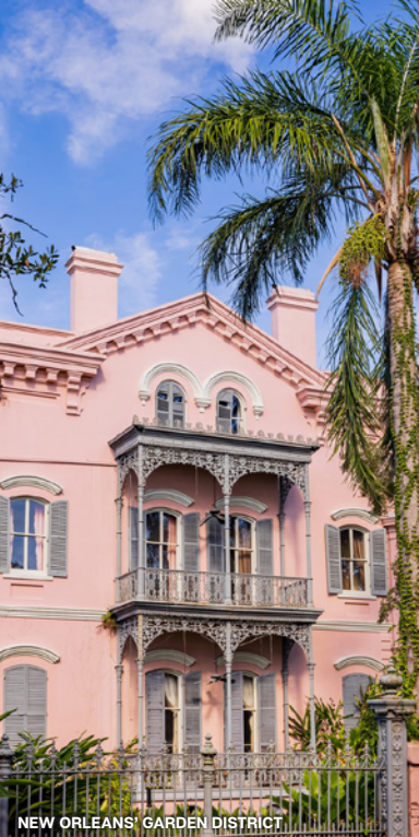
NEW ORLEANS' GARDEN DISTRICT