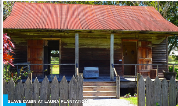
SLAVE CABIN AT LAURA PLANTATION

Estate and Garden, one of the few privately maintained formal gardens of the 19th century; Myrtles Plantation, reputed to be one of the most haunted homes in America; and the Oakley Plantation, the home of John James Audubon.