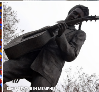
ELVIS STATUE IN MEMPHIS