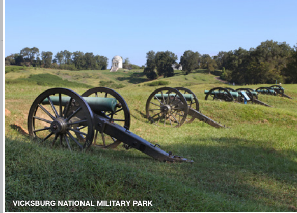
VICKSBURG NATIONAL MILITARY PARK