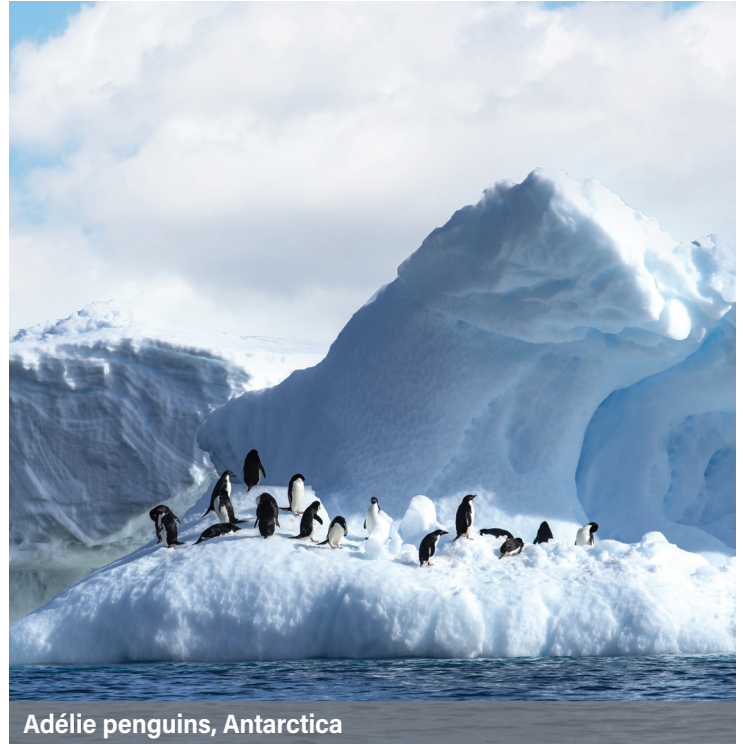
Adélie penguins, Antarctica

presidential palace, and other sites. On the evening of January 12th, gather at the hotel for a reception and briefing to prepare for tomorrow's flight to Ushuaia and embarkation on Vega . (B)