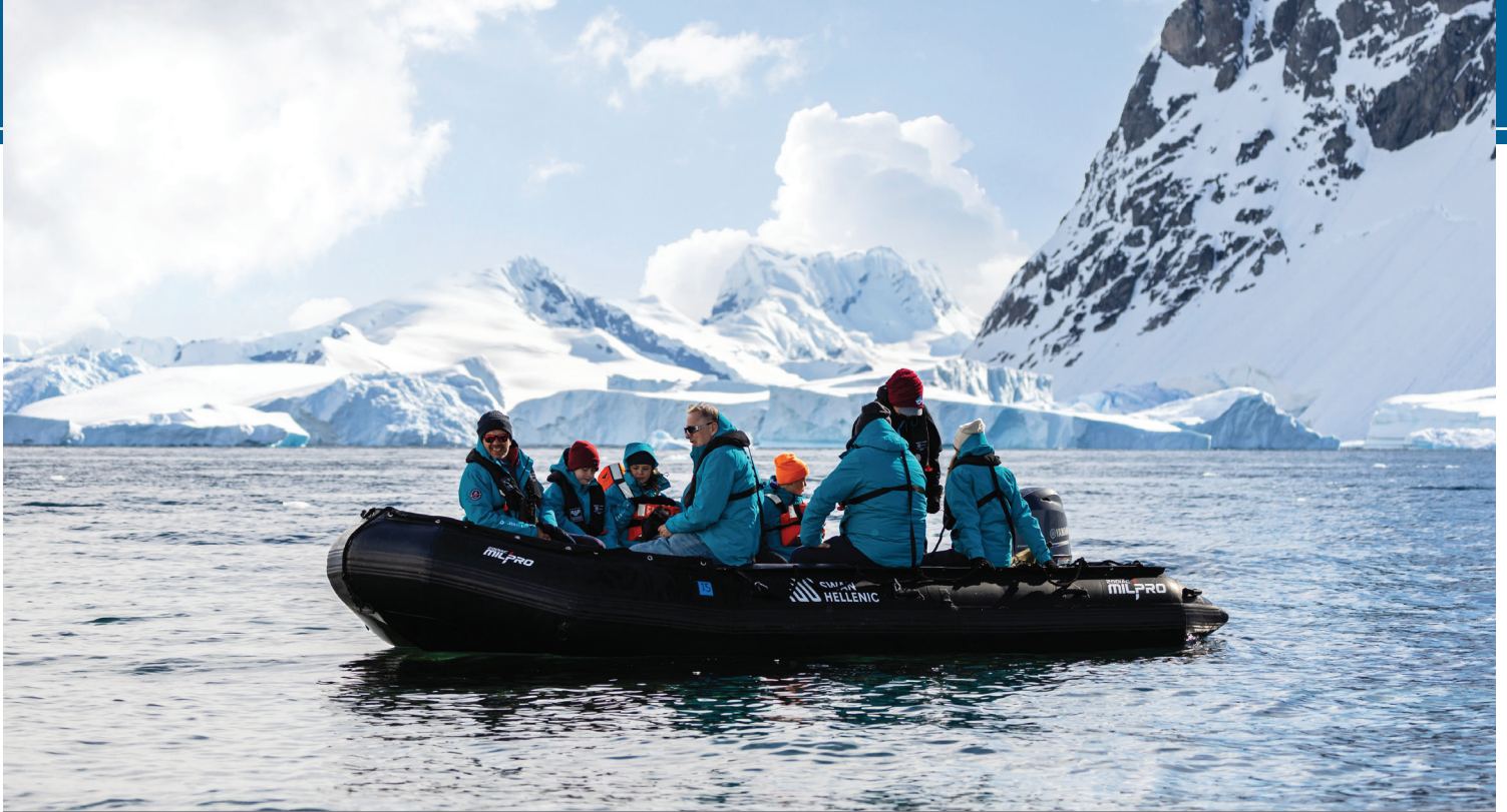
Get close to the scenery and wildlife with the ship's fleet of Zodiacs.

that may accompany the ship as we make our way to the White Continent. (B, L, D)