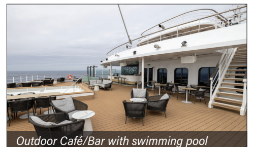
Outdoor Café/Bar with swimming pool

Built in Finland and launched in July 2022, Swan Hellenic's Vega is a new-generation expedition cruise ship. Although at 10,250 tons the ship is large enough to accommodate more than 250 passengers, Vega will accommodate a maximum of 152 guests in 76 spacious staterooms and balcony suites. The low guest density results in one of the most generous indoor and outdoor space-to-guest ratios among cruise ships.