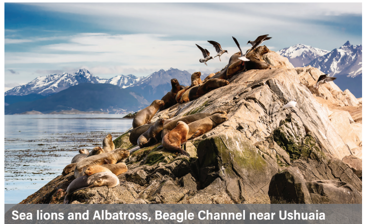
Sea lions and Albatross, Beagle Channel near Ushuaia

Attend lectures and briefings on what lies ahead and enjoy the ship's facilities as Vega navigates the Drake Passage to Antarctica. Keep a lookout for the albatrosses, Cape petrels, and whales