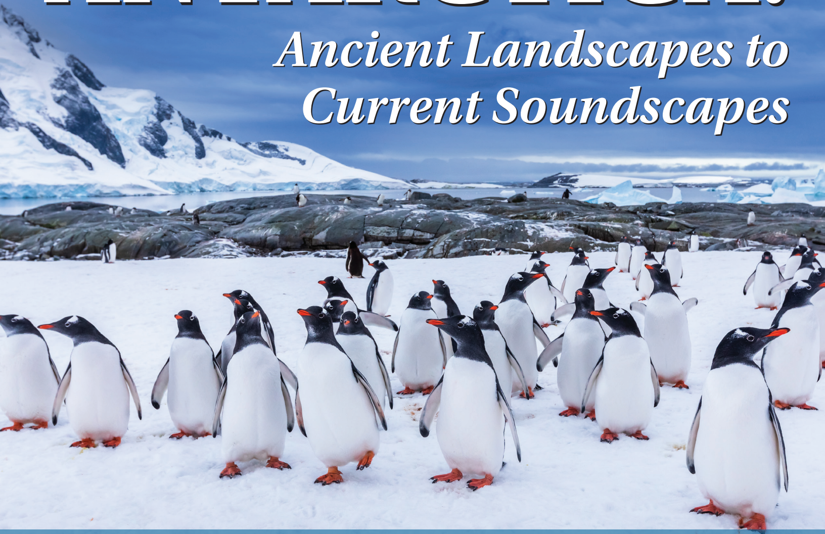
Gentoo Penguin, Antarctica

Aboard the new, 152-guest Expedition Cruise Ship, Vega January 9-24, 2024