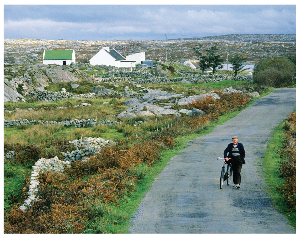
Rural scene in the Connemara, which we explore on Day 5.