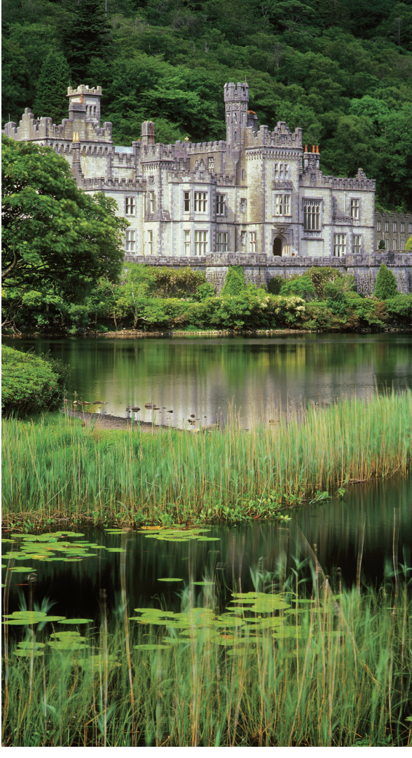
We tour Kylemore Abbey, home to Benedictine nuns.