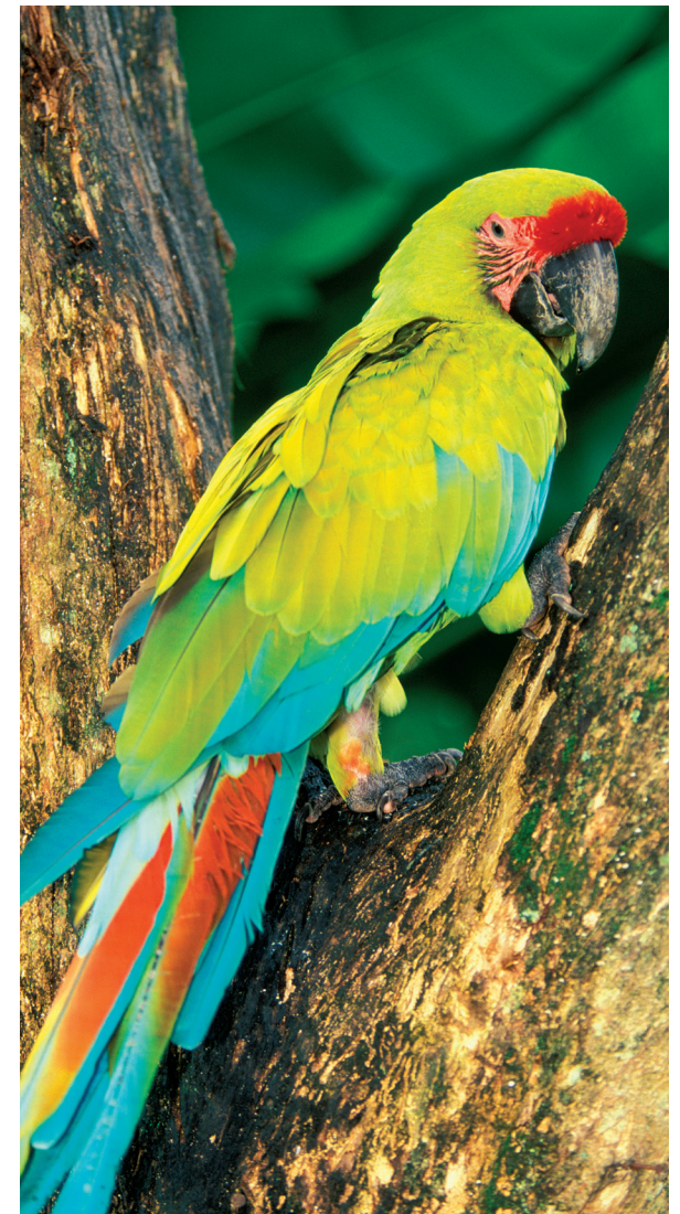
Local birdlife includes the Great Green Macaw.