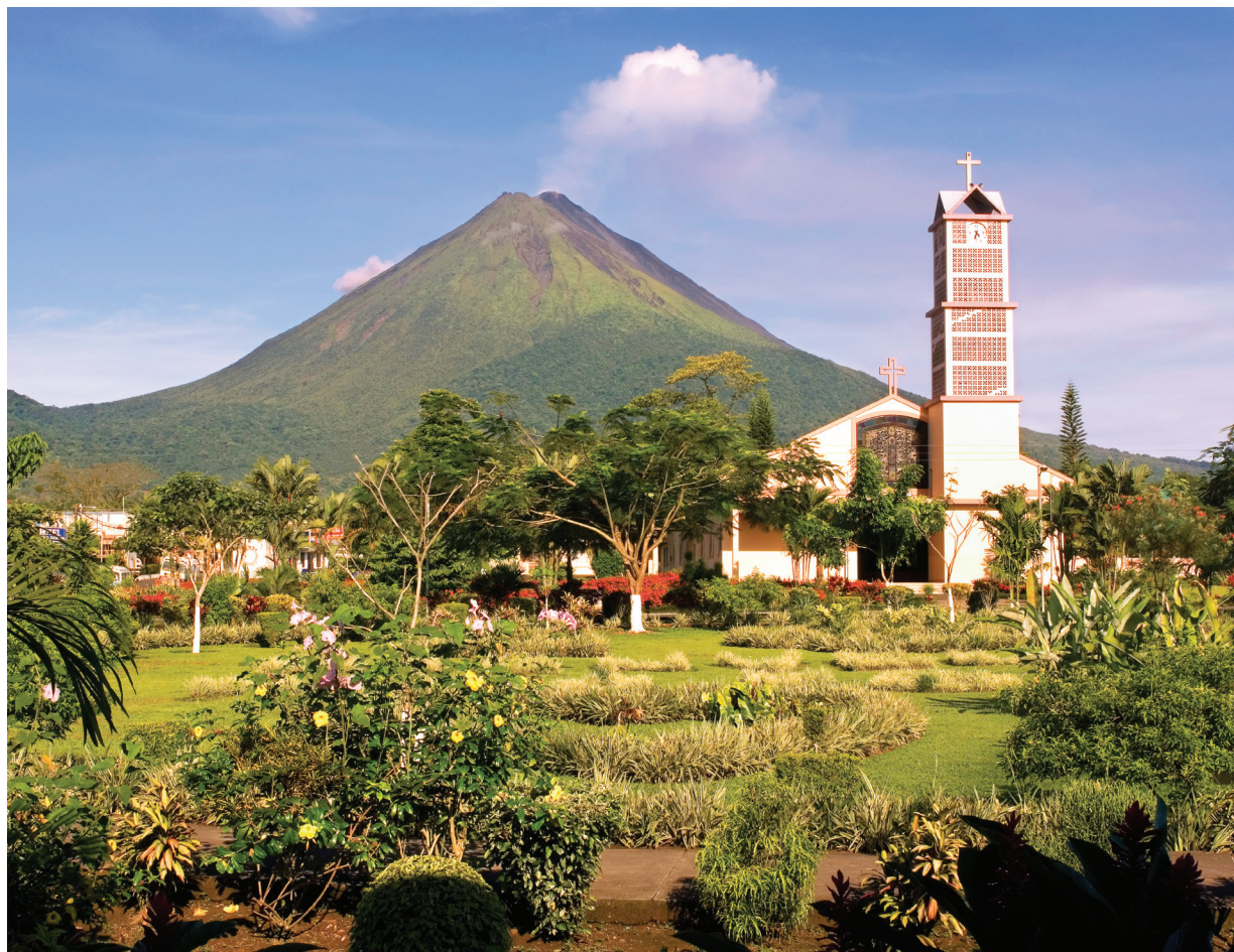
We see Arenal, one of the world's most active volcanoes, from a safe distance.

Day 1: Depart for San Jose, Costa Rica We arrive in the Costa Rican capital and transfer to our hotel located in the Escazu area outside the city. This afternoon and evening are at leisure.