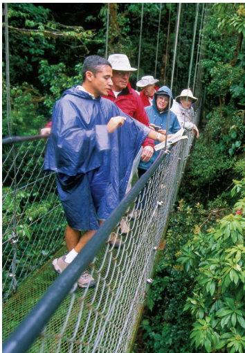
Arenal’s hanging bridges

Day 8: Monteverde/Guanacaste We depart by coach this morning for Guanacaste, Costa Rica’s