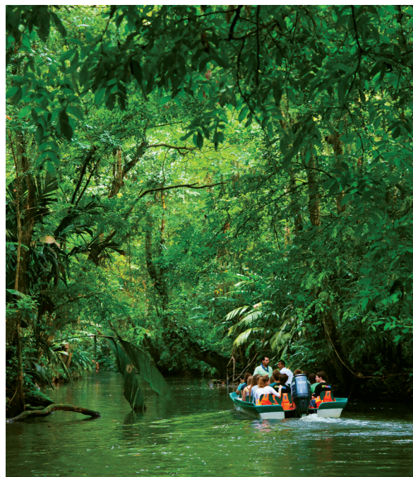
We explore Tortuguero’s canals on the pre-tour option.

Day 11: Depart for U.S. We transfer to the airport this morning for our return flights to the U.S. B