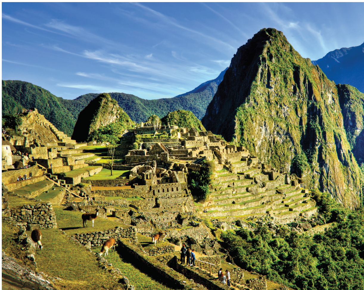
Just 50 miles from Cuzco, Machu Picchu (ca. 1450) was unknown to the outside world until its rediscovery by Hiram Bingham in 1911.