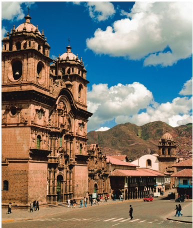
Plaza de Armas, Cuzco

Day 8: Cuzco/Puno This morning we depart for the day-long journey by coach to Puno, on the shores of Lake Titicaca. As we travel through the rugged snow-capped Andes dotted with small villages and herds of llama and alpaca, we make several stops along the way, beginning with Andahuaylillas, an attractive village known for its lovely 17 th -century church. We continue on to the ruins at Raqchi, once the holiest site in