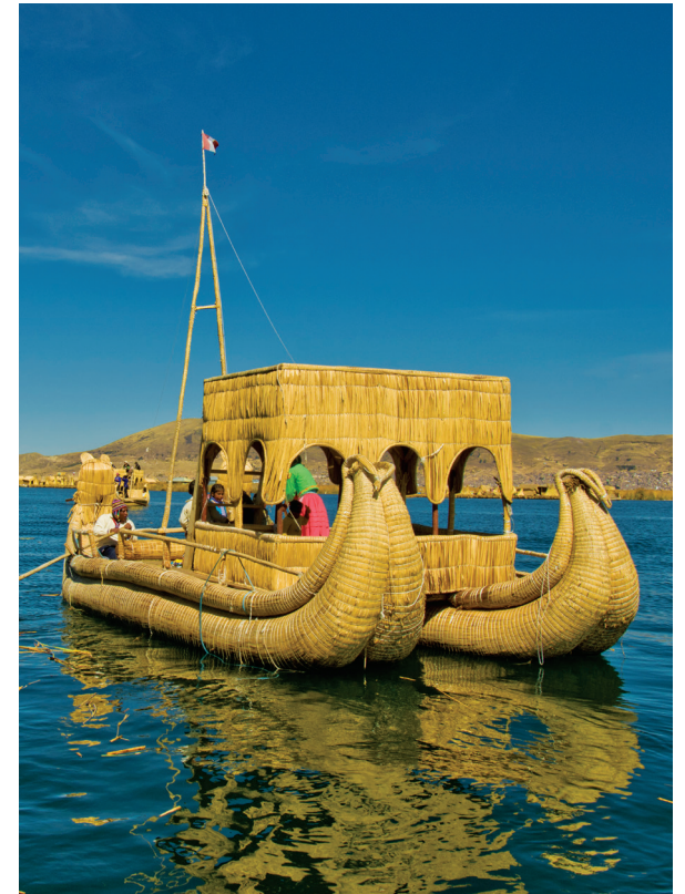
Uros islanders’ reed boat sails Lake Titicaca.

Day 11: Arrive U.S. We arrive in the U.S. this morning and connect with our return flight home.