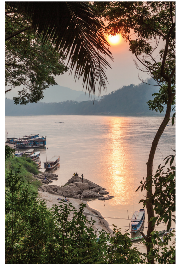
We spend two days cruising the Mekong.

Day 19: Depart for U.S. Today we transfer to the airport for our return flights to the U.S. B