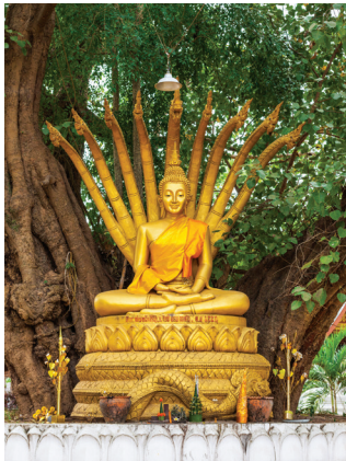
Golden Buddha, Luang Prabang

Day 11: Luang Prabang Our introduction to Laos begins early today with a time-honored tradition: the "tak-bat," where hundreds of saffron-robed monks collect alms from their fellow Buddhists. Later we set out to explore this ancient royal city; our walking tour features the Old City, a UNESCO site, where we tour the beautiful 16 th -century Wat Xieng Thong temple complex, and the National Museum, formerly the royal palace. We return to our hotel for an afternoon at leisure then enjoy dinner in a family restaurant set in a village outside the town and styled like a traditional Laotian stilted bamboo house. B,D