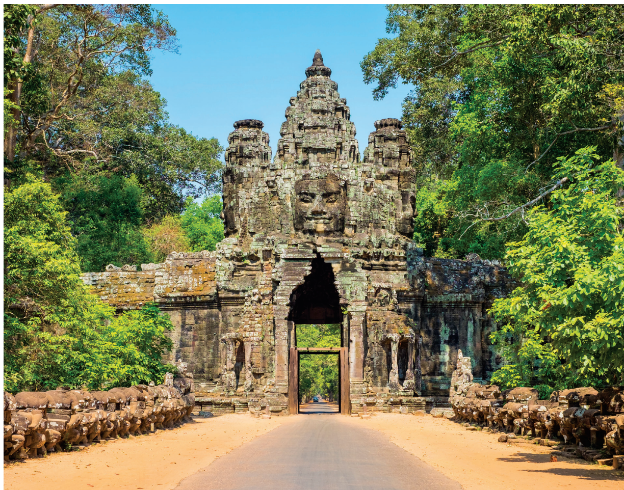
We spend three days touring Cambodia's Angkor Wat temple complex. Above: Victory Gate entrance at Angkor Thom