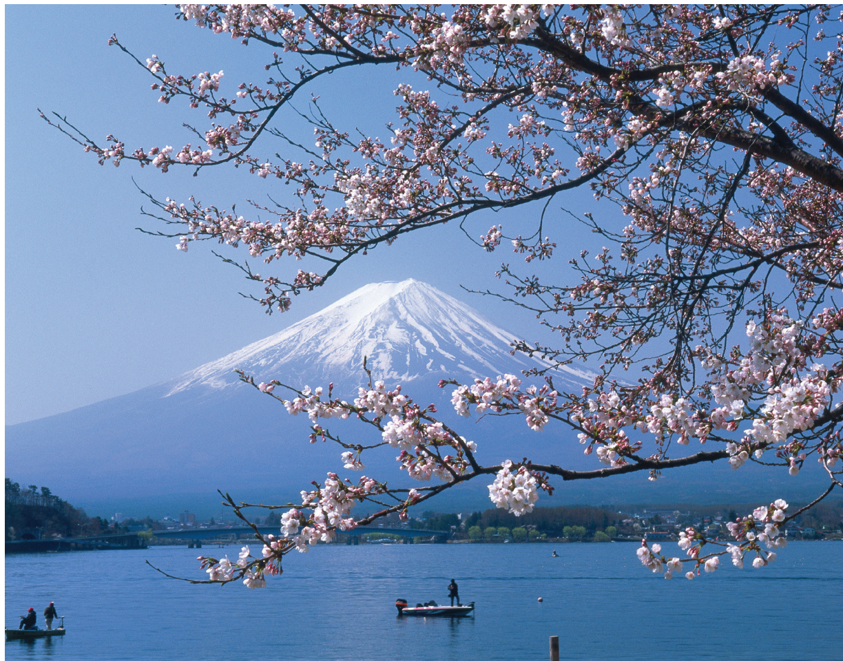
A UNESCO site and "Special Place of Scenic Beauty," beloved Mount Fuji has drawn visitors for centuries.