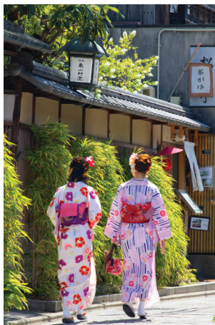
Geishas in traditional dress

Day 8: Takayama/Shirakawago/Kanazawa We leave Takayama this morning for the UNESCO World Heritage site of Shirakawago Gassho-zukuri Village. Comprising buildings relocated from authentic villages nearby that were razed for a dam, the village is also a vibrant community whose residents work together to preserve the unique traditional architecture here known as Gassho style. Then we visit Gokayama Village to see how traditional Japanese washi paper is made. Late this afternoon we reach the castle town