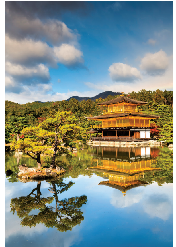
We visit Kyoto's Temple of the Golden Pavilion on Day 10.