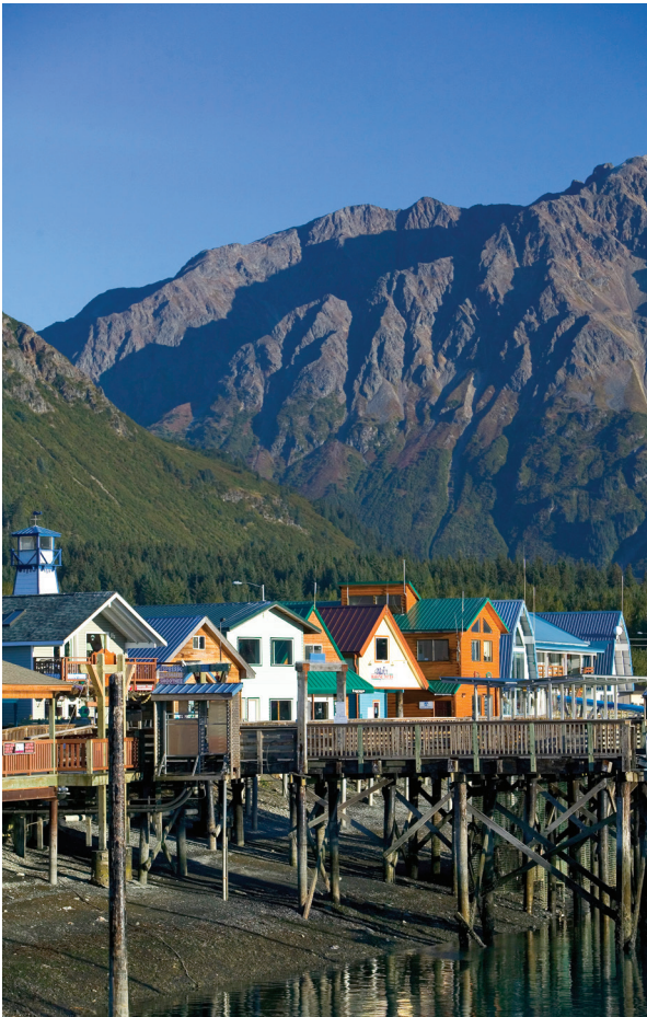
Colorful buildings overlook Seward's harbor.

Day 11: Depart Anchorage We transfer this morning to the Anchorage airport for our flights home. B