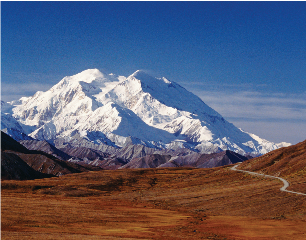
A highlight of any journey to Alaska: Denali, North America’s highest peak

Day 1: Depart for Anchorage, Alaska We depart today for Anchorage, Alaska’s largest city. Upon arrival, we check in to our centrally located hotel then have time to explore on our own. As guests’ arrival times may vary, we have no group activities or meals planned.