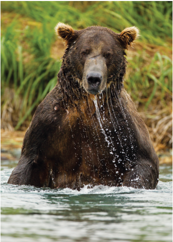
Taking a dip ...

Day 6: Wrangell-St. Elias National Park Home to more than 150 glaciers, Wrangell-St. Elias National Park contains the largest collection of these ice masses in North America. We see one of these glaciers up close today on our singular half-day hike to Root Glacier. After being fitted with crampons – steel shoe spikes created to traverse ice – we begin our three-mile excursion to the glacier and behold the natural beauty before us: unspoiled icefields, blue pools, cascading waterfalls, deep canyons, narrow crevasses. We eat a sack lunch in the wild then return to our lodge for an afternoon at leisure. Tonight, we enjoy dinner together at our lodge. B,L,D