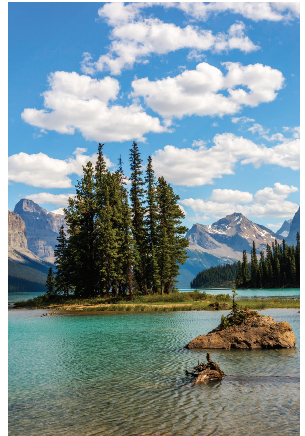
Stunning Maligne Lake and Spirit Island, Jasper National Park

Day 11: Banff/Depart for U.S. We transfer this morning to the Calgary airport for our flights home. B