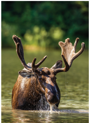
A bull moose enjoys a dip.

Day 7: Lake Louise/Jasper This morning we visit the viewing area to see the lake in the early morning light. Then we depart via the Columbia Icefields Parkway for the drive to the 125-square-mile Columbia