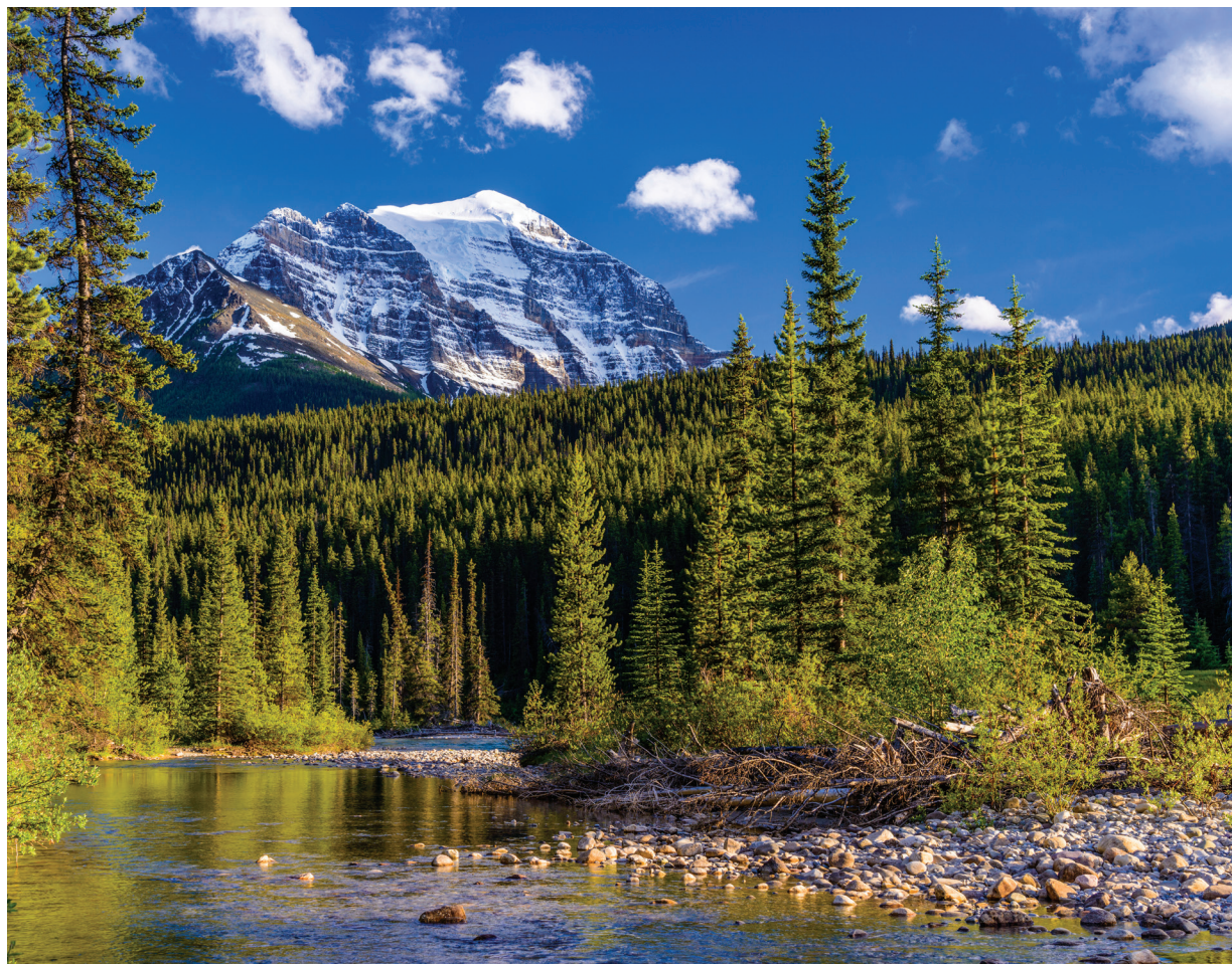
We spend several days amidst the natural beauty of Banff National Park's rivers, mountains, meadows, and forests.