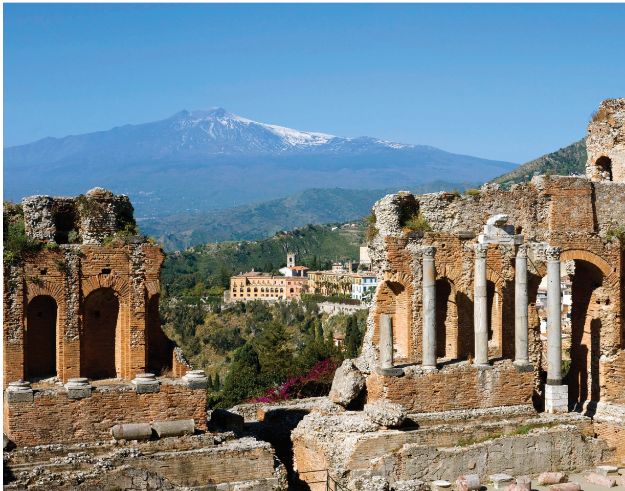
With Mt. Etna as a backdrop, Taormina's 3 rd century Greek theatre still hosts performances today.