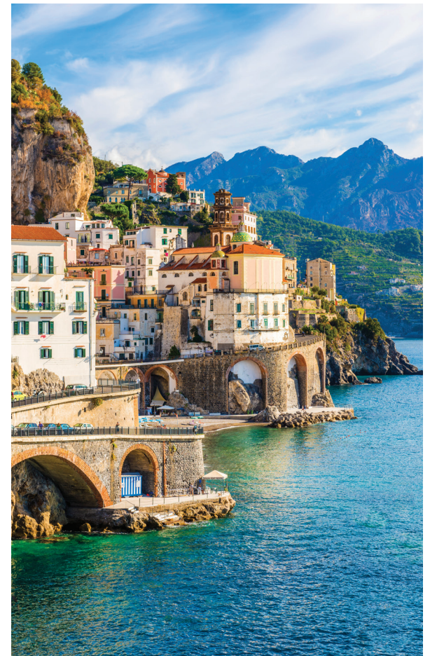
The stunning Amalfi Coast has drawn visitors for centuries.

Day 15: Depart for U.S. This morning we transfer to the Naples airport, where we connect with our return flight to the U.S. B