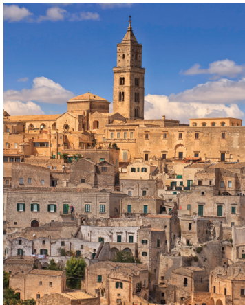
We spend two nights in ancient Matera.

Day 9: Lecce We discover the “Florence of the South” on this morning’s tour, so named for the unique decorative style for which Lecce is known: barocco leccese , the ornate and intricate sandstone carvings of cherubs and monsters, fruits and flowers that adorn local buildings from top to bottom. We see Palazzo Vescovile (c. 1632), the exuberantly decorated church of Santa Croce, and the Duomo with its lovely piazza . This afternoon is at leisure to explore this town of 100 churches as we wish; tonight we enjoy dinner together. B,D