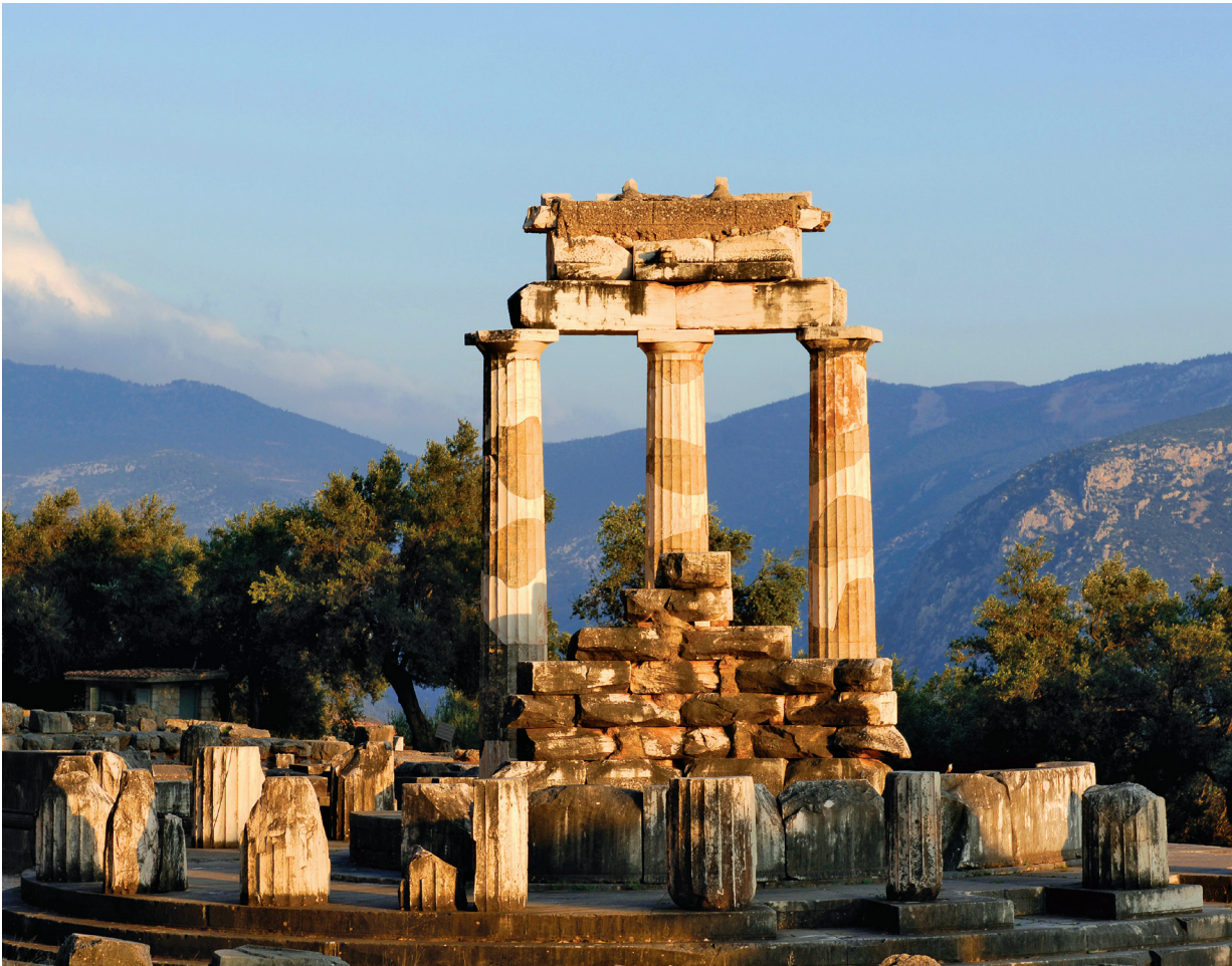
On Day 4, we tour the ruins of Delphi, believed by the ancients to be the “navel [center] of the world.”

Ratings are based on the Hotel & Travel Index, the travel industry standard reference.