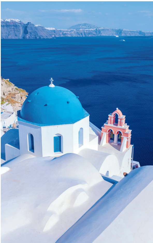
We spend two nights in idyllic Santorini.

including international airfare and all taxes, surcharges, and fees