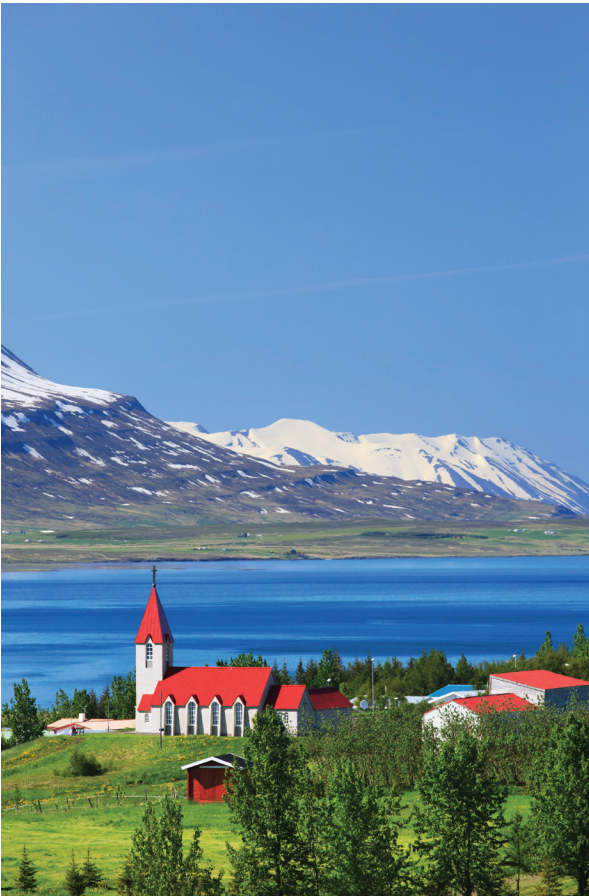
Iceland’s landscape reveals an austere beauty.

including international airfare and all taxes, surcharges, and fees