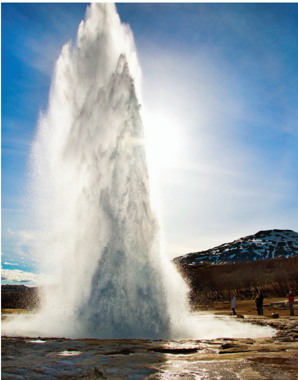
Iceland’s hot spring geysers are famous natural attractions.

Day 11: Depart for U.S. Today we depart for the airport and our return flights to the U.S. B