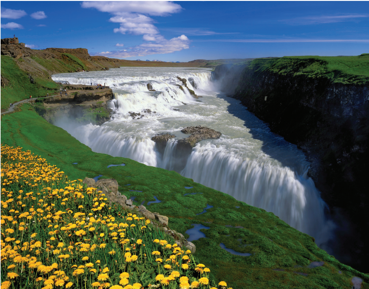
Unique Gullfoss, which we visit on Day 9, ranks as one of Iceland's best loved sights.

Ratings are based on the Hotel & Travel Index, the travel industry standard reference.