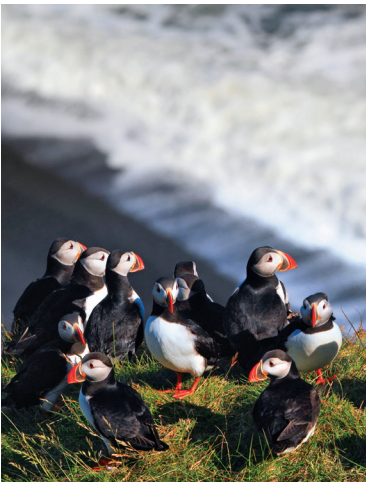
We may see puffins on our tour.

Day 8: Borgarbyggö/Snaefellsnes Peninsula Today we encounter the stunning Snaefellsnes Peninsula. We begin with a walk along the shell sand beach at the abandoned fishing village of Budir, surrounded by a vast lava field. We also explore the caves and bizarre rock formations along the rugged shore at Arnarstapi, site of thousands of nesting cliff birds. After a lunch of a traditional fresh seafood soup at a rustic oceanfront restaurant, we see the haunting remains of abandoned coastal farms at Djupalonssandur. B,L,D