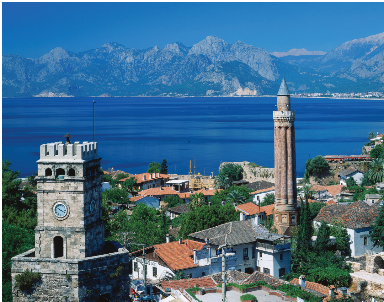
An Antalya landmark, the Yivli Minare (fluted minaret) overlooks the Turquoise Coast.