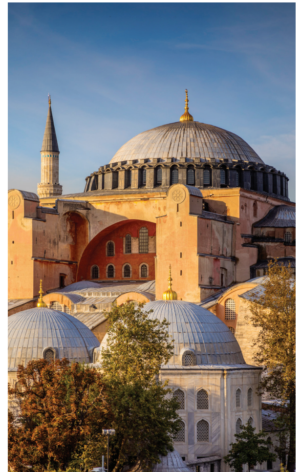
Istanbul’s Hagia Sophia

Day 15: Depart for U.S. This morning we board an early flight for our return to the United States. B