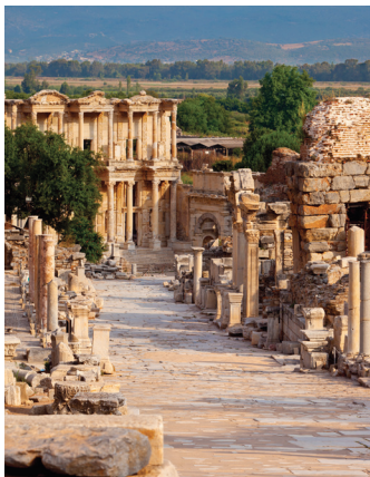
Ruins at Ephesus

Day 9: Kusadasi/Ephesus We return to Ephesus to visit the Basilica of St. John, the 6 th -century ruins that stand over what is believed to be the burial site of John the Apostle. Then we learn about Ephesus through the ages, as we tour the Ephesus Museum, housing treasures from the archaeological site. After lunch together, we stop at a carpet factory to watch a demonstration of this age-old craft. B,L,D