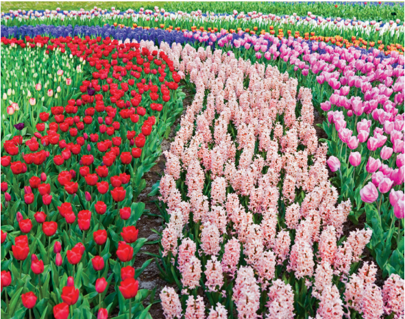
Tulips in bloom at Keukenhof

Day 8: Bruges/Bastogne/Luxembourg We travel today to tiny Luxembourg, the world’s only Grand Duchy and once the crossroads of Western Europe. En route we honor the 77,000 American troops killed or injured in the deadliest battle of WWII, which took place in the Ardennes, the deeply forested region flanking Belgium, France, and Luxembourg. The Battle of the Bulge, as it became known, left an indelible mark on the region, as we see on our visit to the Mardasson Memorial, commemorating those who died here. We also tour the adjacent Bastogne War Museum, which provides a dramatic look at