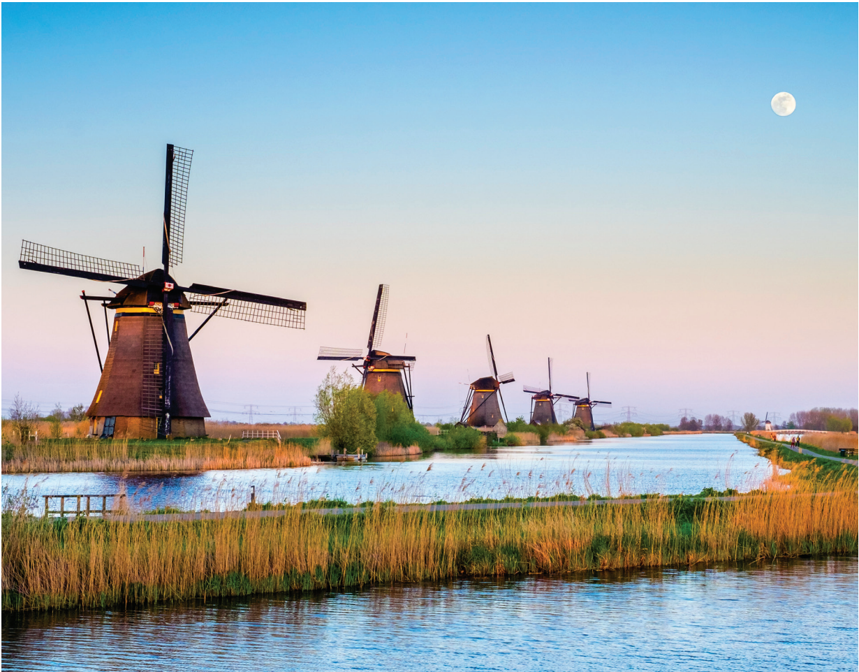
On Day 5 we visit Kinderdijk, where the historic windmills have operated since the mid-1700s.

Ratings are based on the Hotel & Travel Index, the travel industry standard reference.