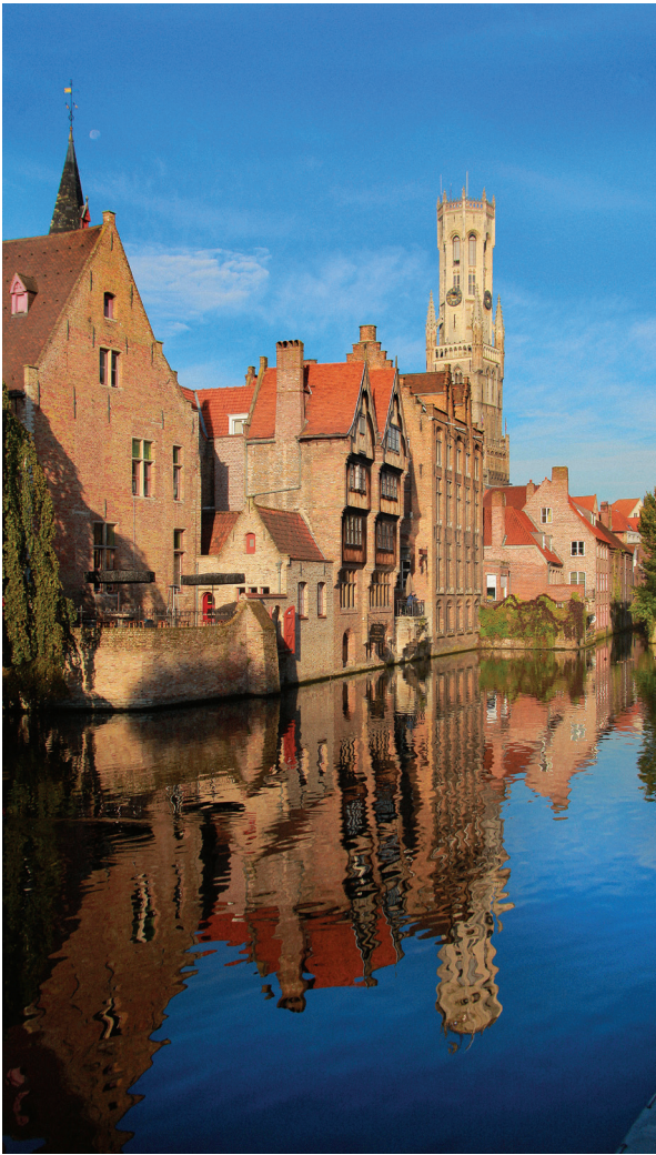
Medieval Bruges, one of Europe’s most beautiful cities

including international airfare and all taxes, surcharges, and fees