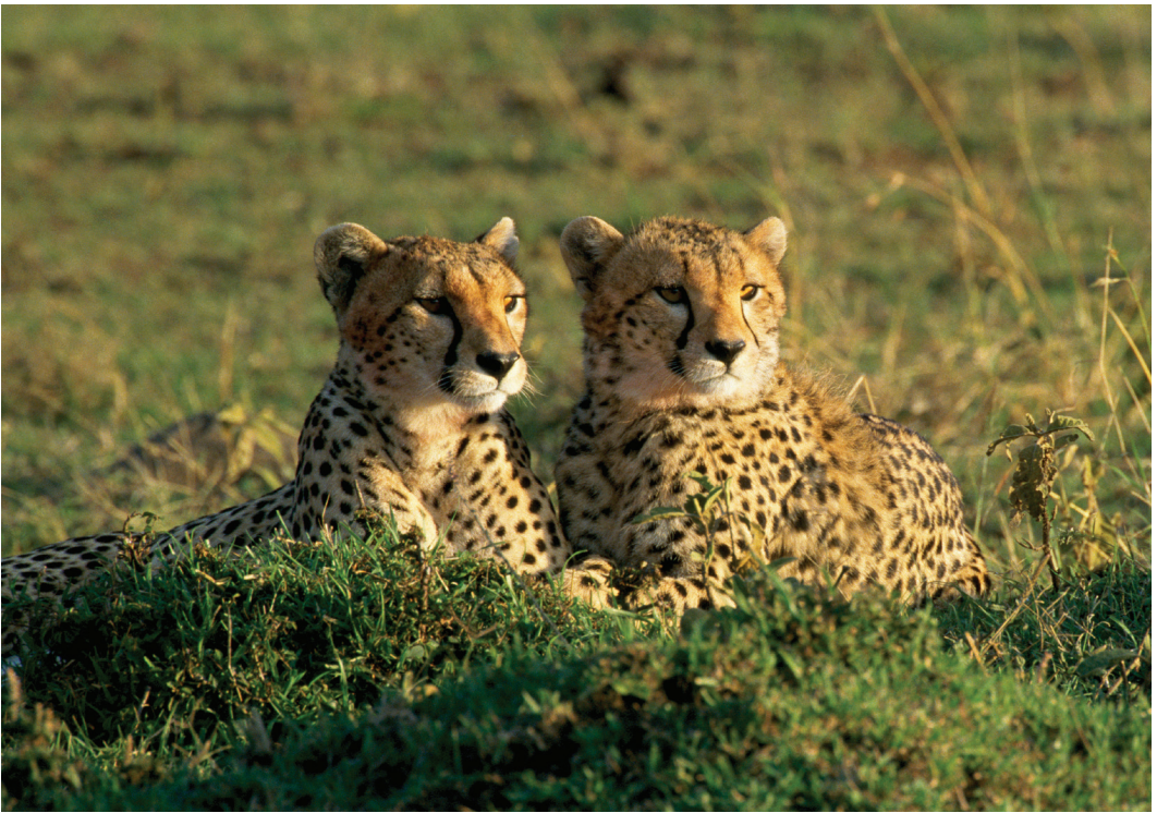
We may see cheetahs, the fastest land animal.

the world’s largest intact and perfectly formed volcanic caldera. The unique biosphere here has remained unchanged for eons; towering walls encircle the crater’s floor which represents Africa in microcosm: grassland, swamps, lakes, forests, and some 25,000 mammals, including elephant, black rhinoceros, lion, hippo, and zebra. Then we return to our lodge for an afternoon at leisure. B,L,D