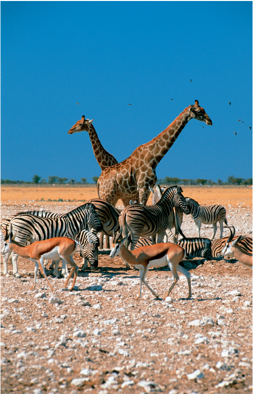
Tarangire National Park teems with diverse wildlife.

Day 10: Serengeti We embark on more wildlife drives today. We have the chance to see some – or all – of Africa’s “Big Five:” lion, Cape buffalo, elephant, rhino, and leopard, along with wildebeest, zebra, eland, gazelle, and other plains animals, and some 500 species of birds. B,L,D