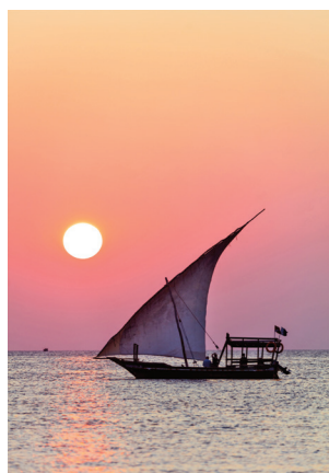
Traditional dhow sails off Zanzibar.

Day 12: Zanzibar A morning tour of a spice plantation reveals why Zanzibar is known as the “Spice Island” – its bounty of cloves, nutmeg, ginger, chilies, black pepper, vanilla, coriander, and cinnamon have found their way around the world for centuries. We