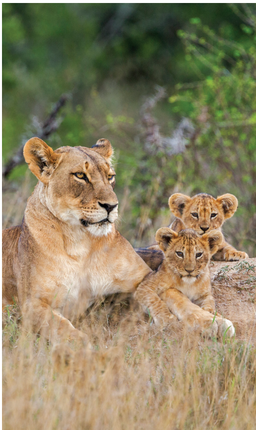
Lioness with her cubs