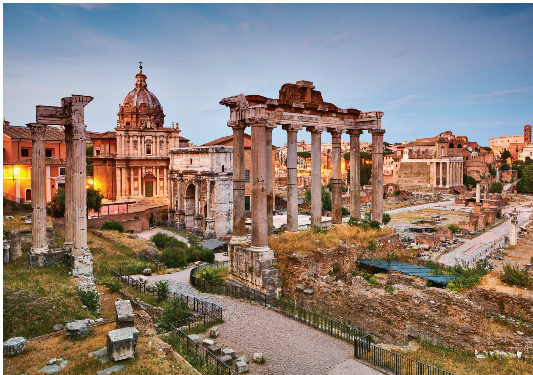
The Roman Forum dates to the 7 th century BCE.

Day 7: Rome This morning we tour the heart of ancient Rome: the 55,000-seat Colosseum, built in 72 CE to stage gladiator spectacles; and the temples of the Forum, ancient Rome's political and legal center. The afternoon is free to explore on our own; the possibilities endless: shopping along the fashionable Via Veneto; sipping espresso in beautiful Piazza Navona; seeing the Pantheon, the city's best preserved ancient building; tossing a coin into Trevi Fountain; or visiting any number of renowned museums and churches. B