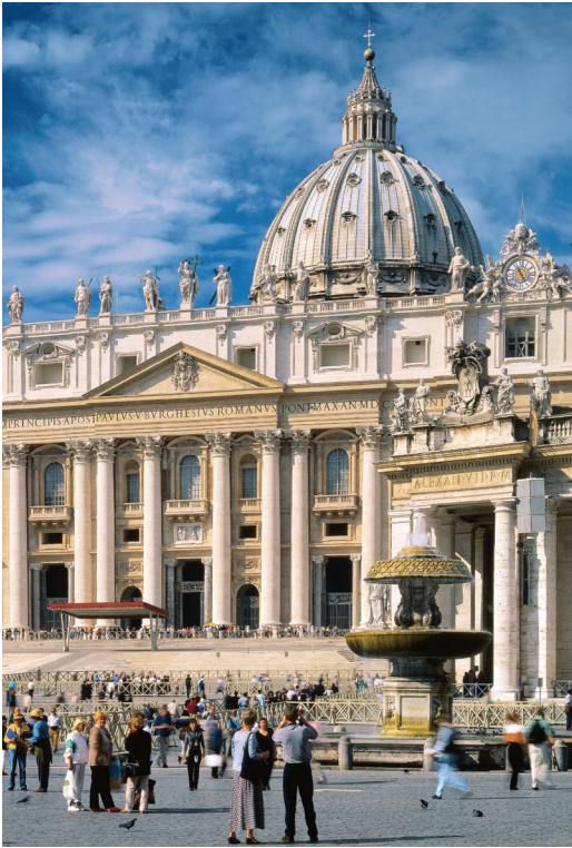
We visit St. Peter’s Square and Basilica on Day 6.

Day 15: Venice This morning we take a guided walk through St. Mark’s Square and surroundings. Our afternoon is free to explore Venice independently; tonight we bid “ arrivederci ” to Italy and our fellow travelers at a farewell dinner. B,D