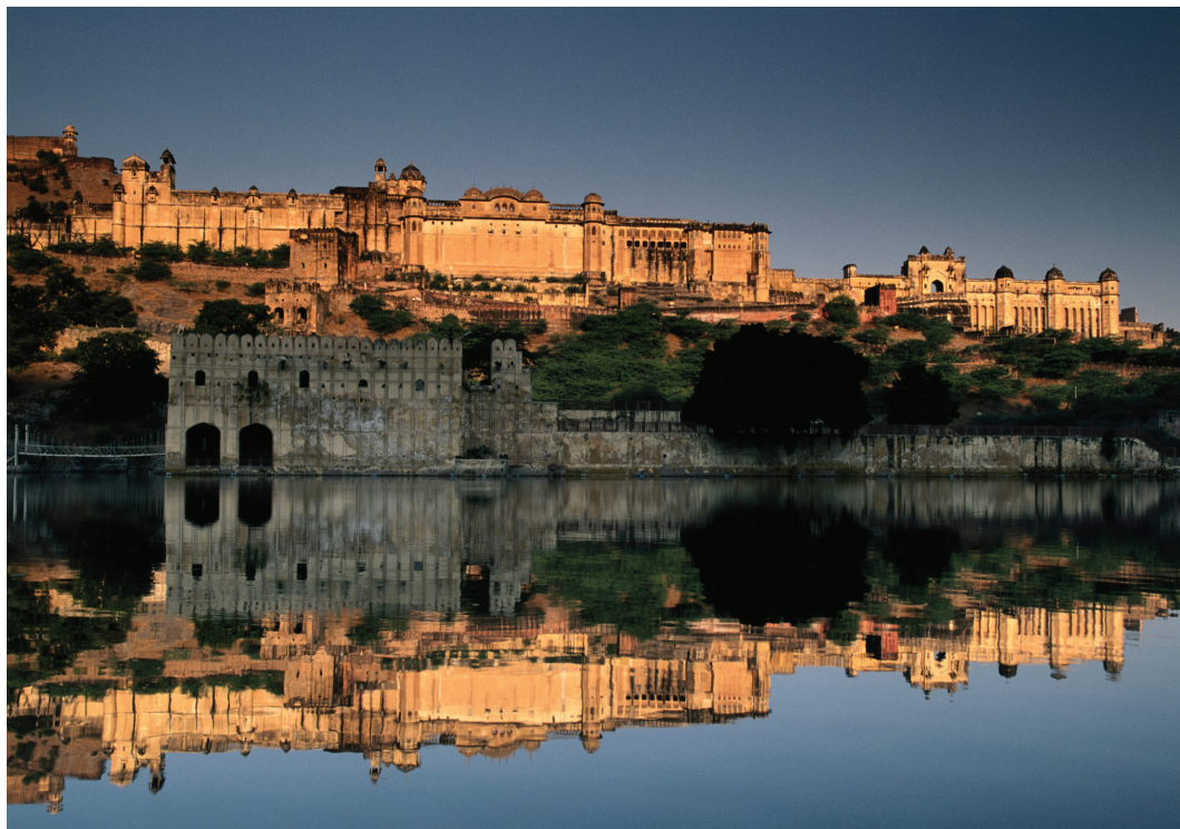
Visit Amber Fort, a UNESCO World Heritage site, on Day 6.

Day 8: Jaipur/Ranthambore We travel today to Ranthambore National Park, the former hunting ground of the Maharajah of Jaipur and now a 512-square-mile natural preserve that is home to hundreds of species of birds, reptiles, mammals, and of course, Bengal tigers. This afternoon we take our first game drive through the park. B,L,D