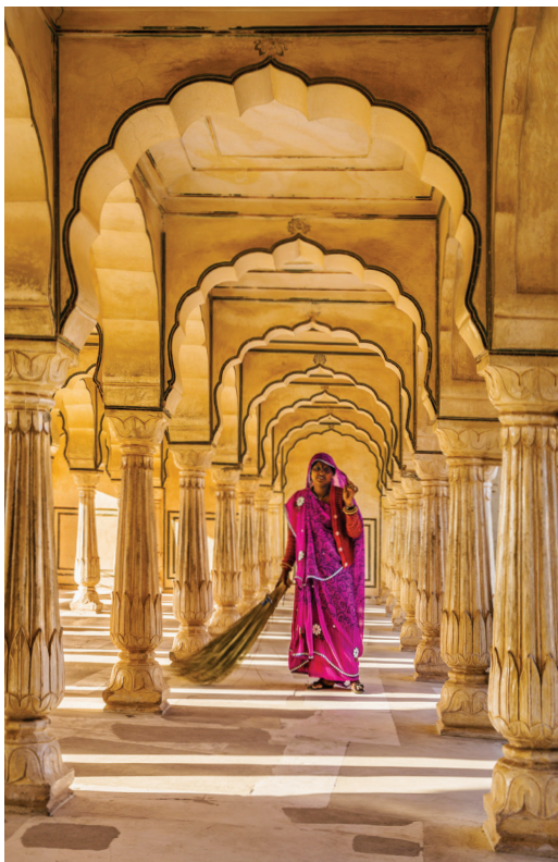
Amber Fort, former Rajput capital