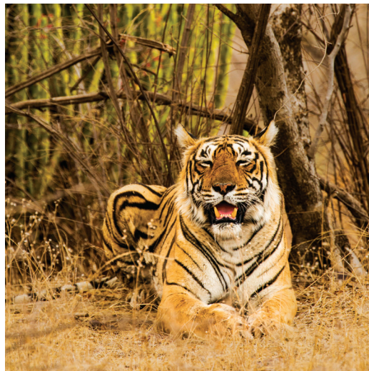
Bengal tiger rests in Ranthambore.

Day 17: Return to U.S. Very early this morning we transfer to the airport for our return flight to the U.S.