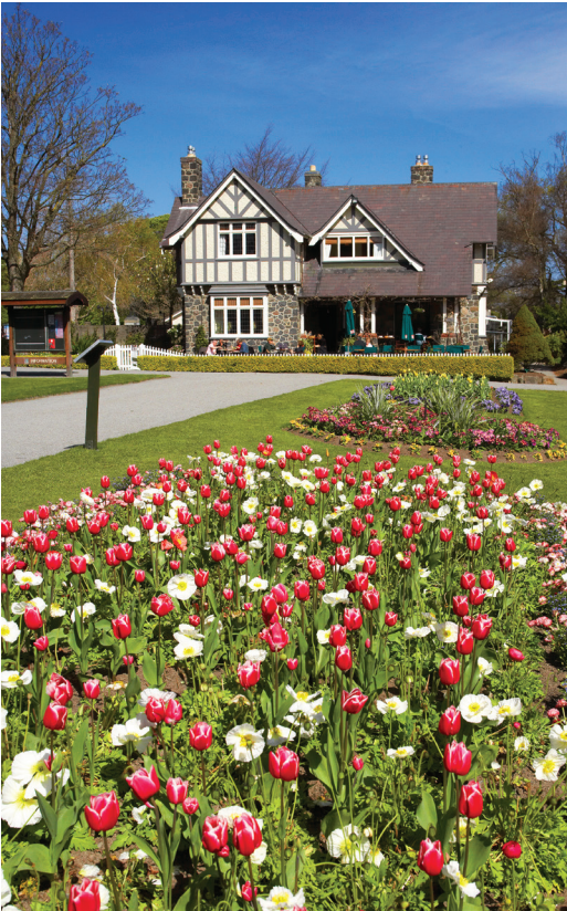
We tour Christchurch’s Botanic Gardens on Day 10.