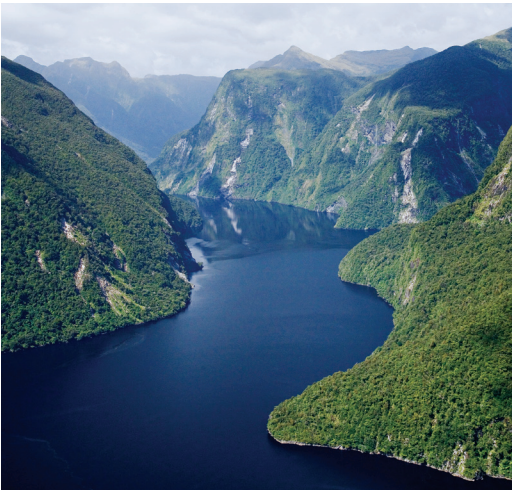
We cruise Doubtful Sound on Day 14.

Day 16: Depart for U.S. We depart this morning for the airport and our return flights home. B