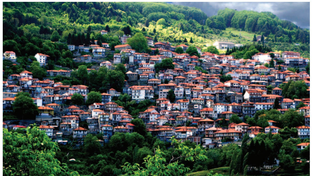
Metsovo and its characteristic architecture

After a morning at leisure, travel to Nikopolis, the city founded by Emperor Augustus after his victory at the Battle of Actium. Explore its