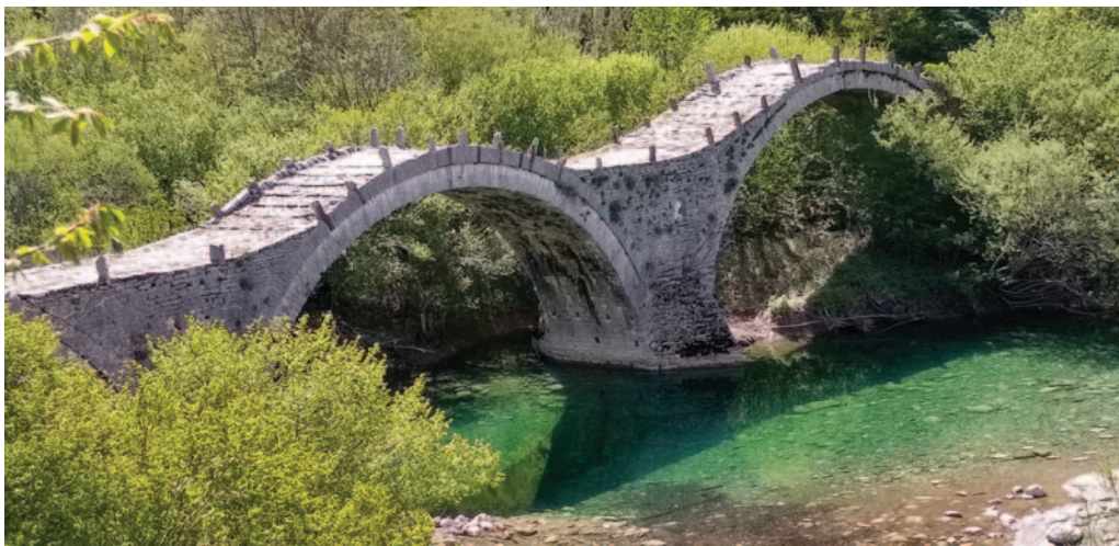
Triple-arched stone bridge dating from the 18th-century in the Zagori region