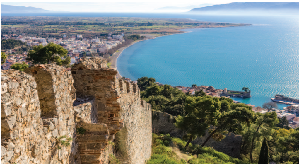
View from the walls of fortress of Nafpaktos